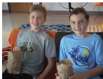
Popcorn & a Movie