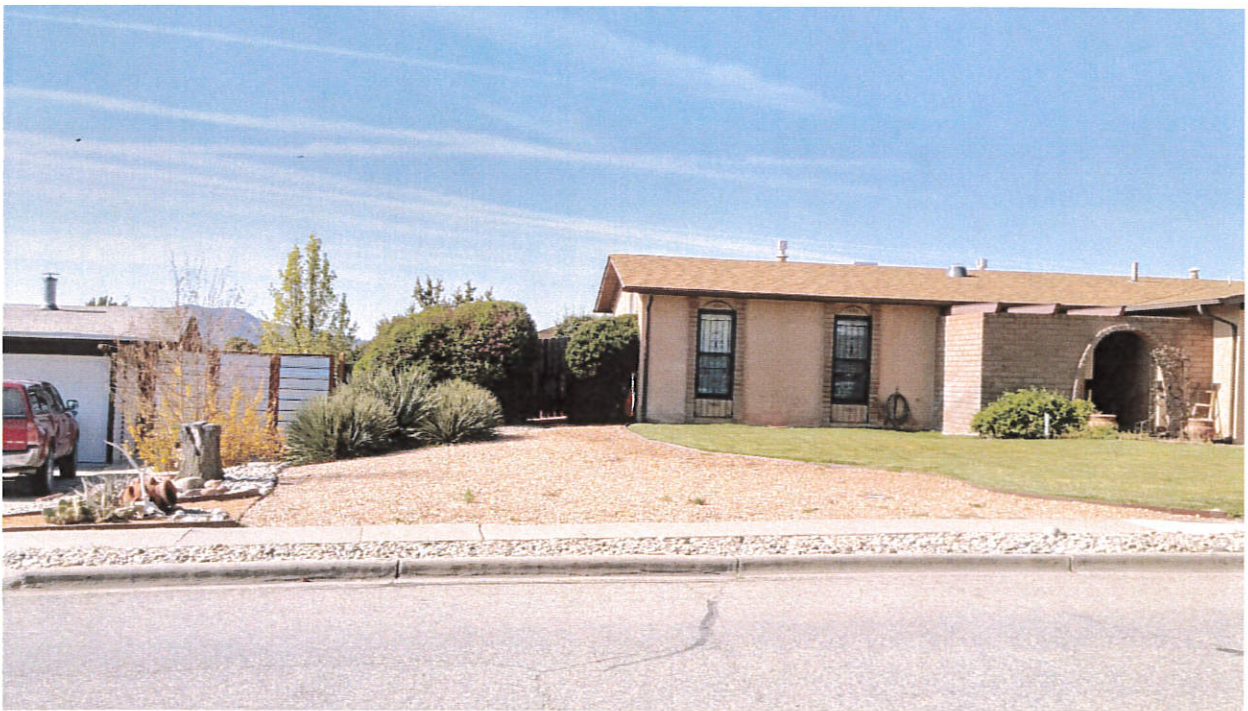
2 – SW side yard (opposite side yard); 307 Rover Blvd.