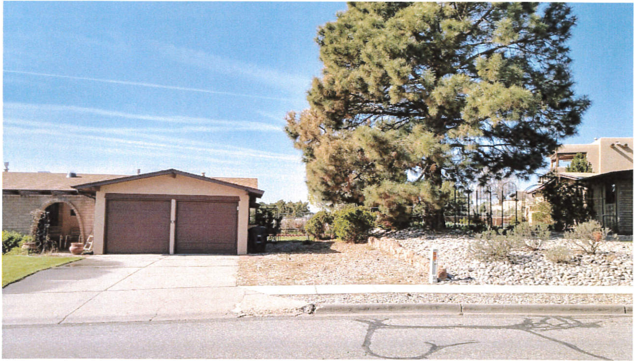
1 – Location of proposed Carport; 307 Rover Blvd.