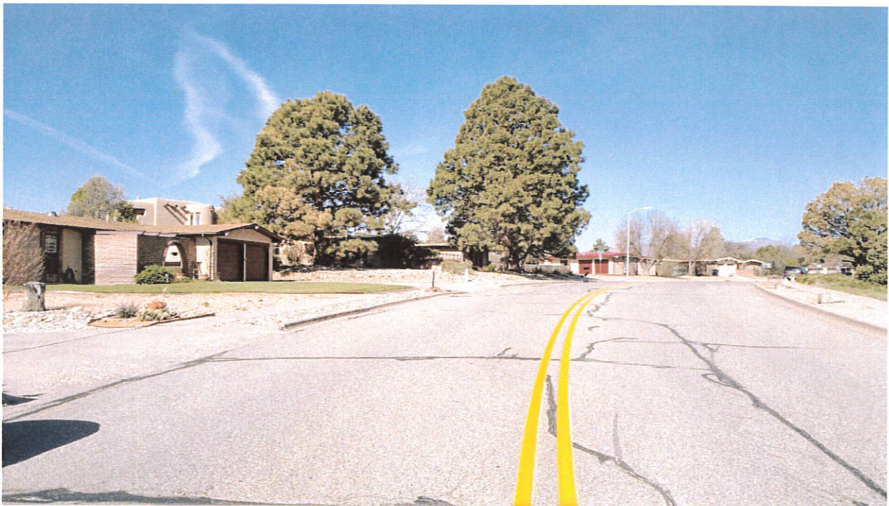
4 – Sight Distance with Residence (on Left), 307 Rover Blvd.