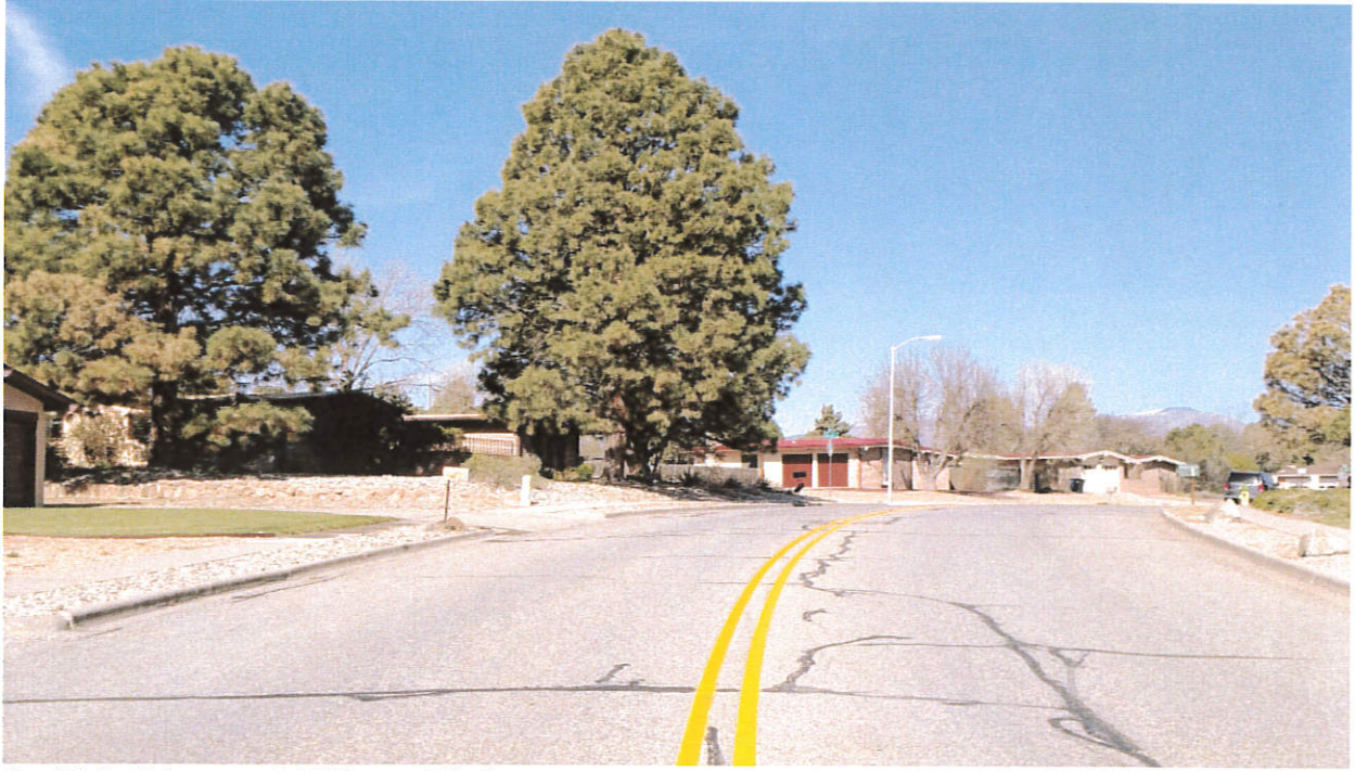
3 – Sight Distance, 307 Rover Blvd.