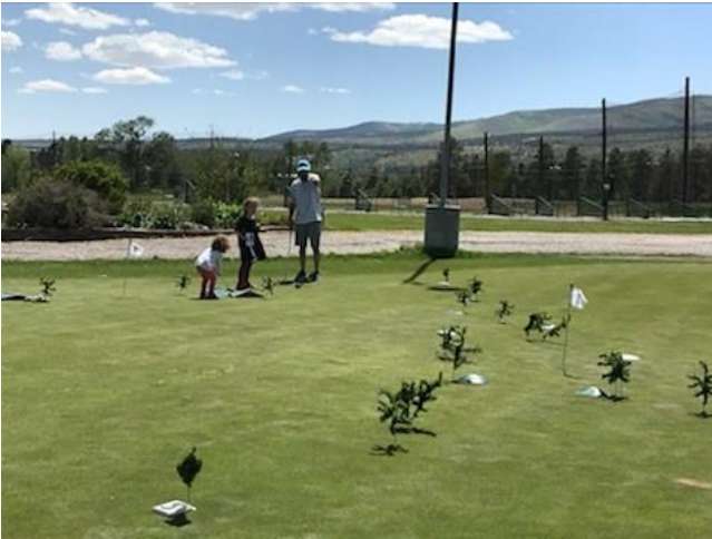
Barranca Mesa 2 nd Grade Class Visits Golf Course: