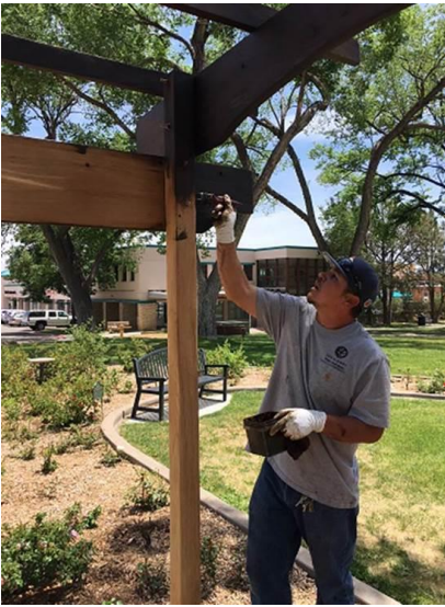
Painting continues at Overlook Concession Stand. 90% complete: