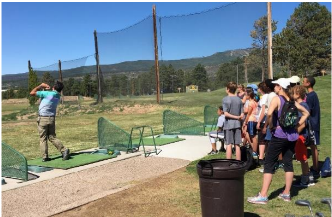
Knights of Columbus Tournament - June 22st, 2108, 60 participants