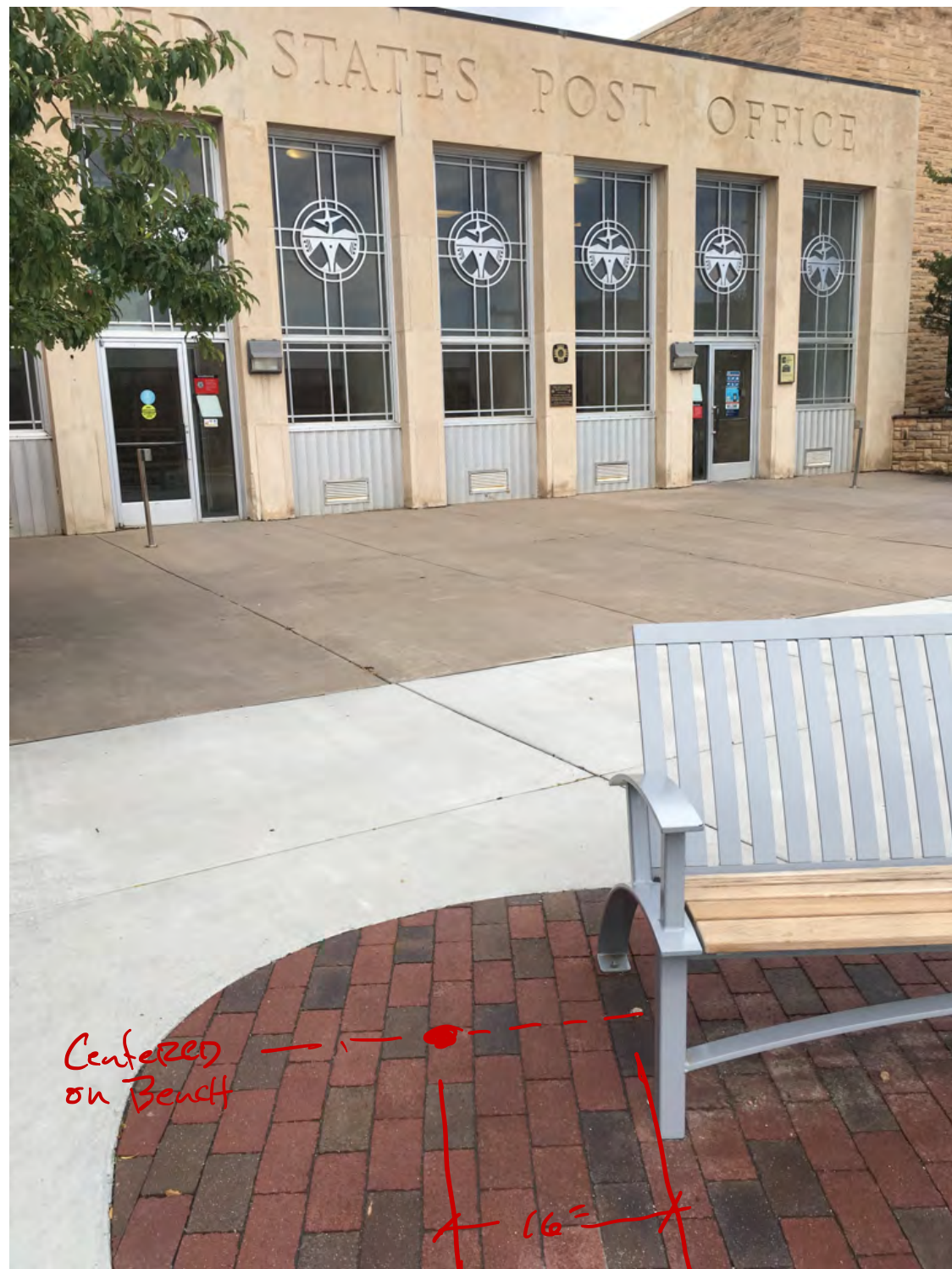
WT.G.11 - Post Office Walking Tour Sign