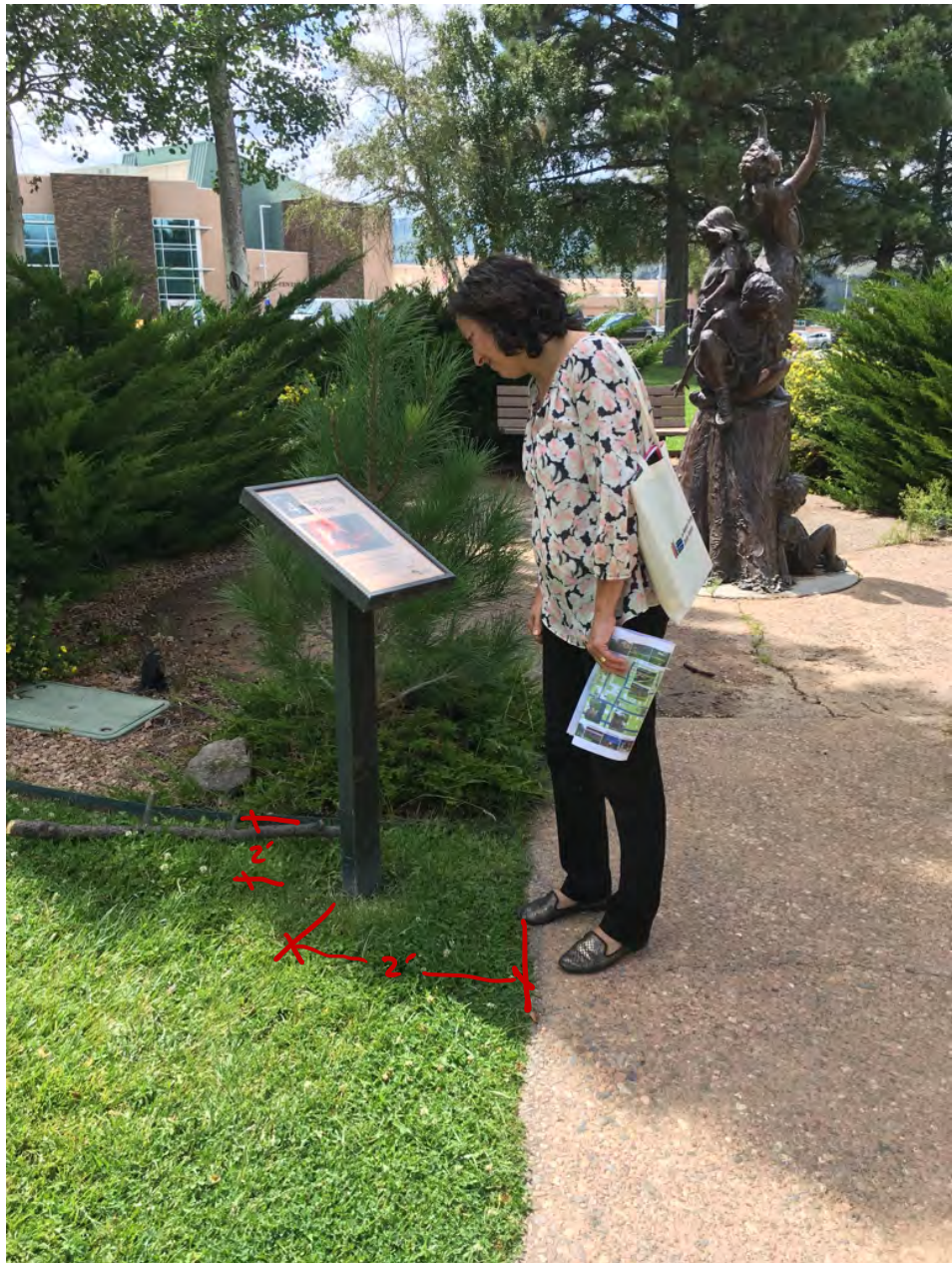
WT.G.14 - Touch the Sky Walking Tour Sign