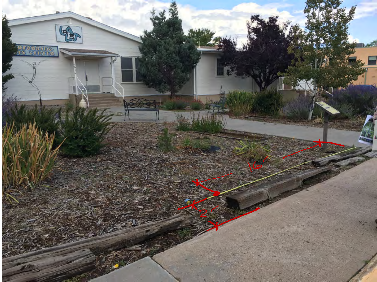
WT.G.09 - Performing Arts Center Walking Tour Sign