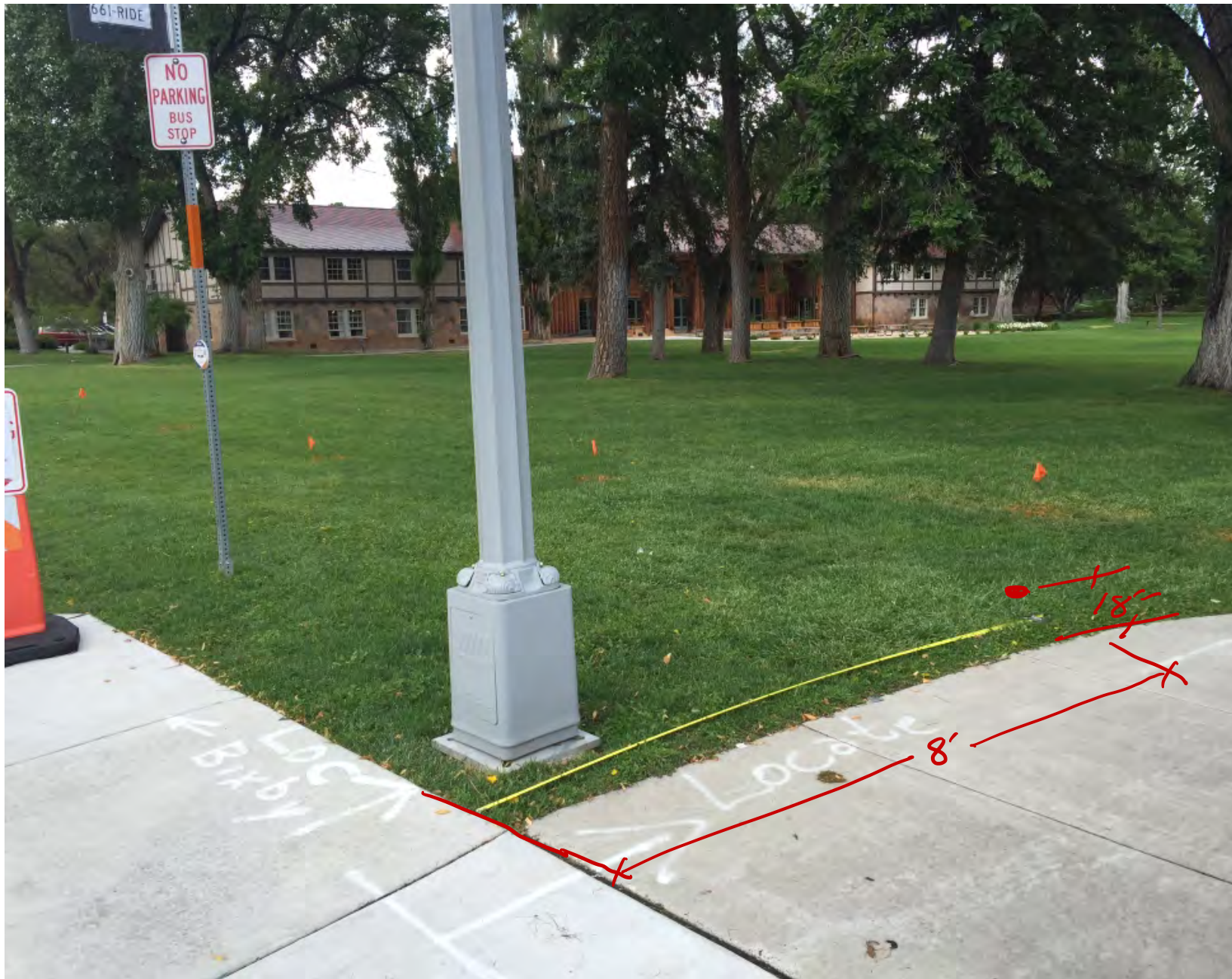
MC.0.3.G.01 - Minor Campus Introduction - SE Entry