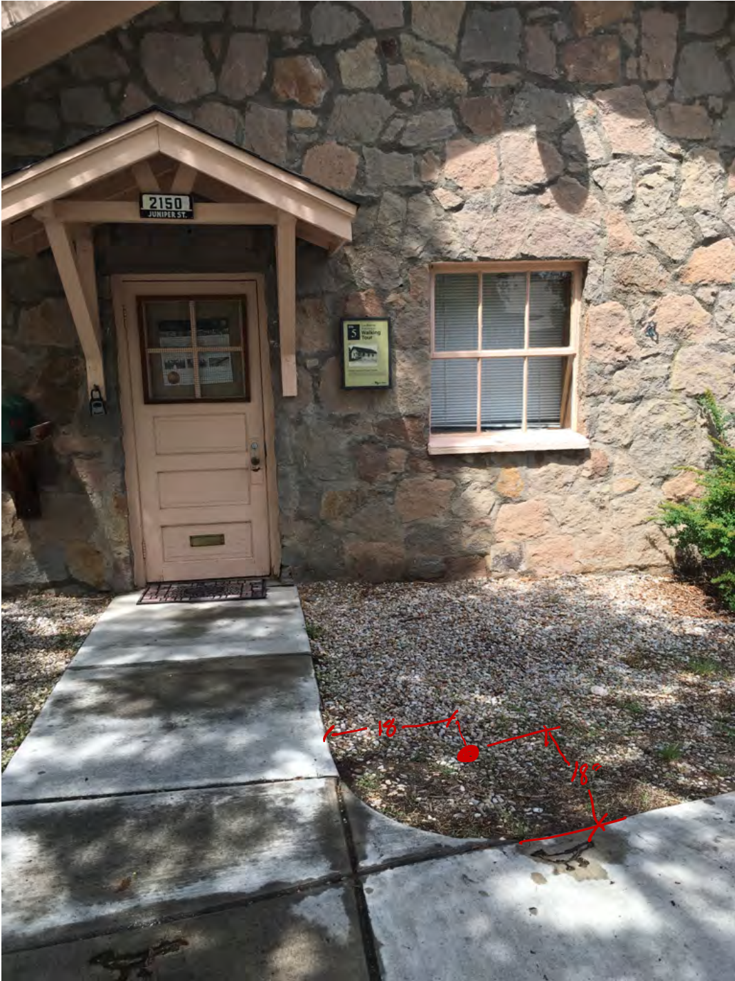
WT.G.15 - Power House Walking Tour Sign