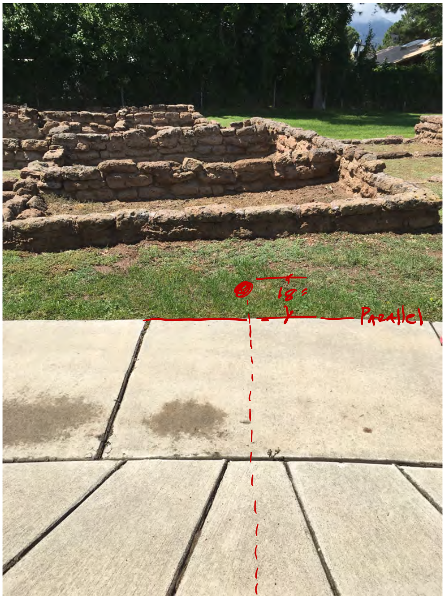
WT.G.06 - Ancestral Pueblo Walking Tour Sign