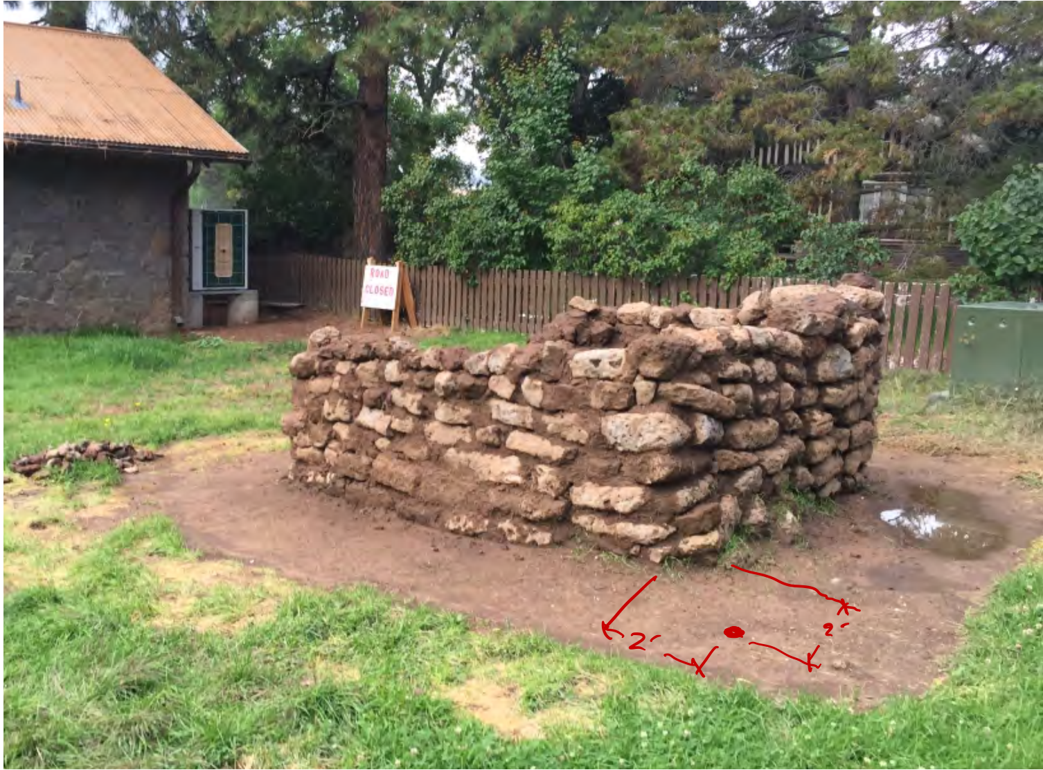
WT.G.16 - Chimney Stack Minor Walking Tour Sign (Snake Stack Sign Holder)