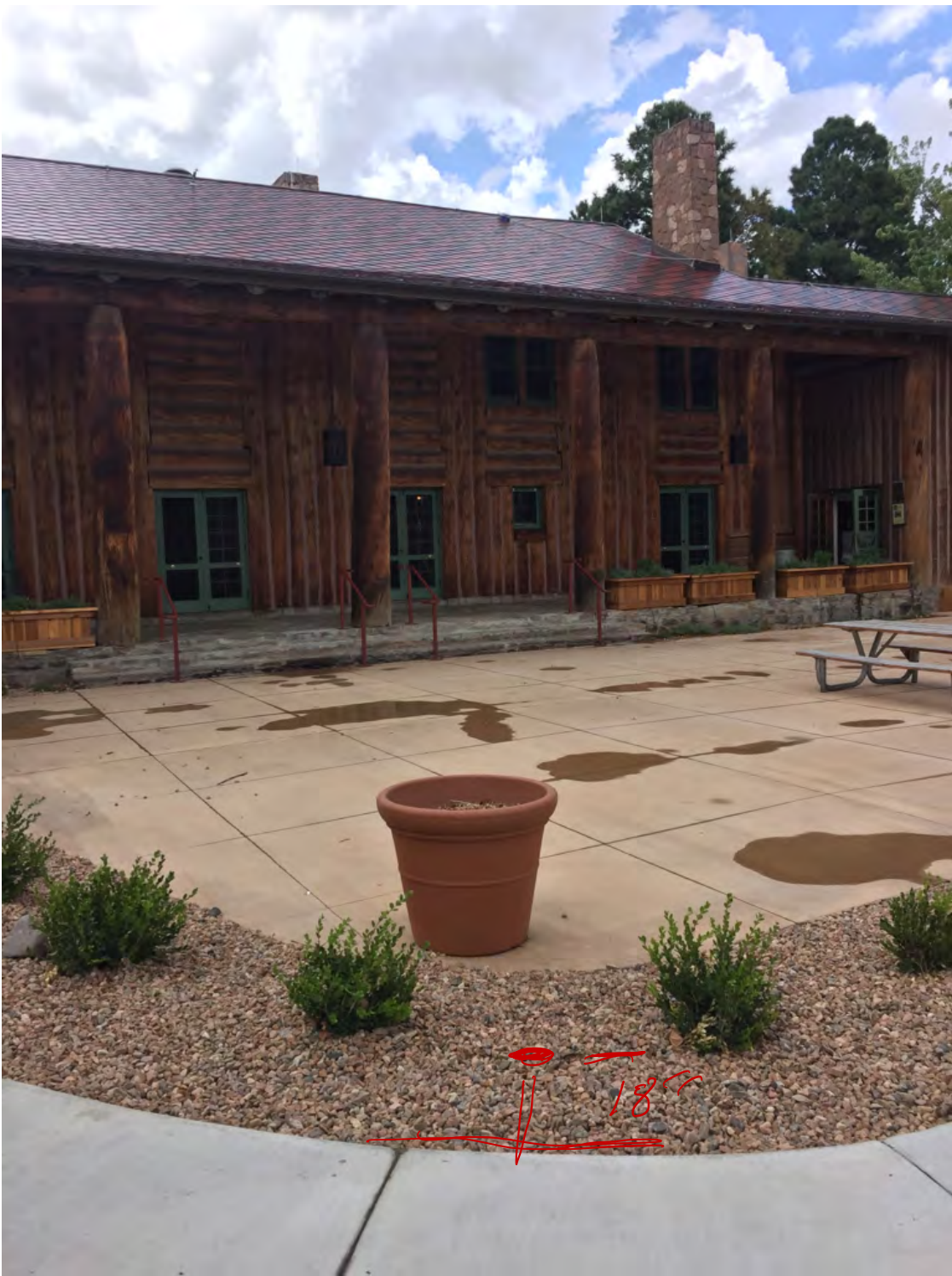
WT.G.12 - Fuller Lodge Walking Tour Sign