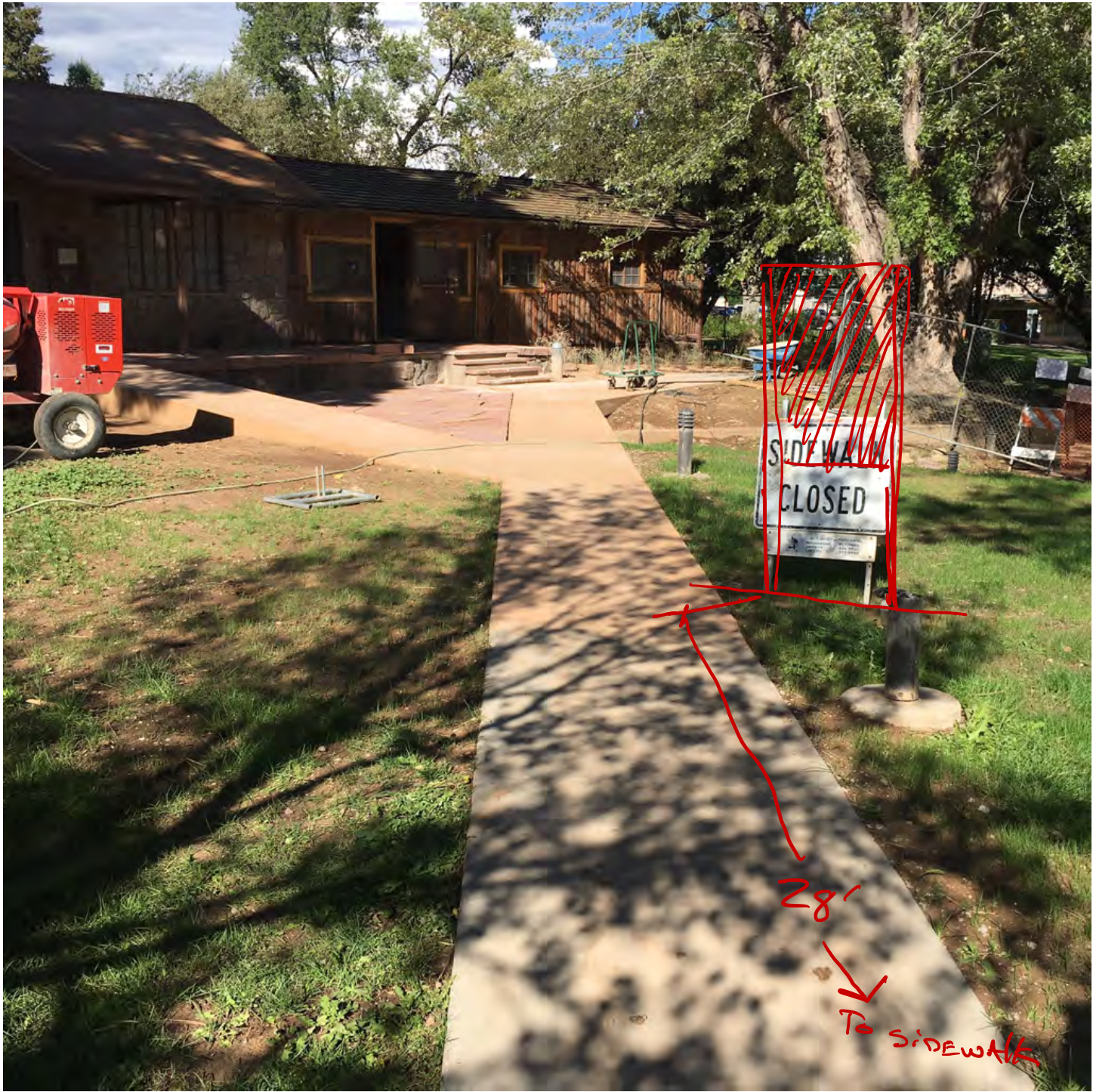
MC.0.1.G.01 - Museum Campus Introduction