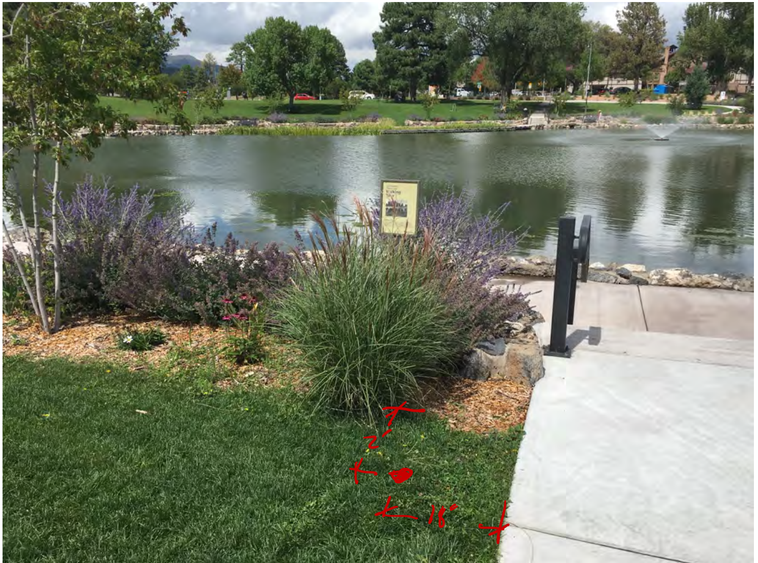
WT.G.13 - Ashley Pond Walking Tour Sign