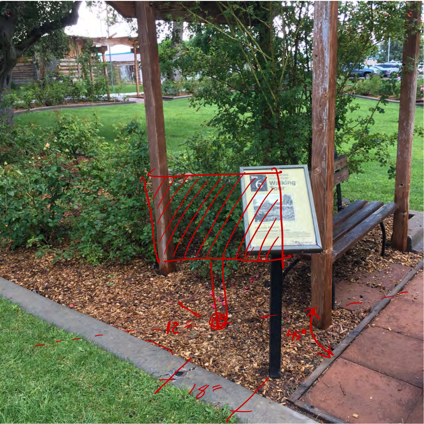
WT.G.02 - Rose Garden Walking Tour Sign