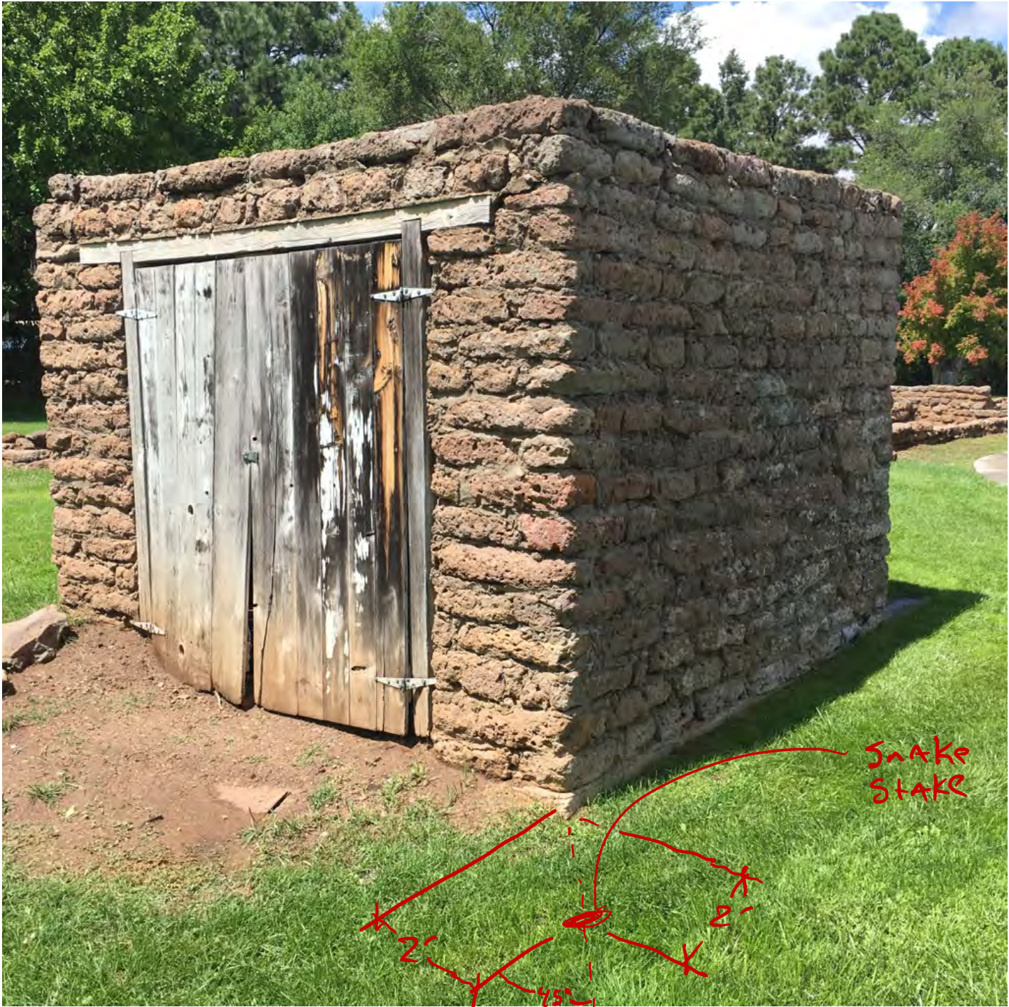
WT.G.04 - Fire House Minor Walking Tour Sign (Snake Stake Sign Holder)