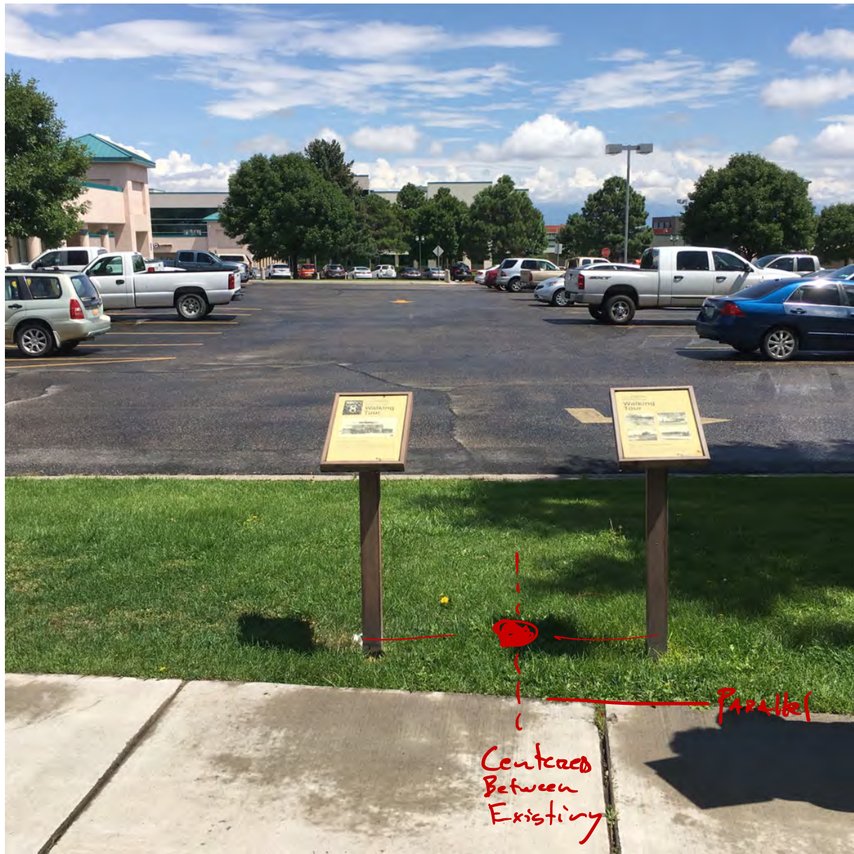
WT.G.05 - Big House Walking Tour Sign