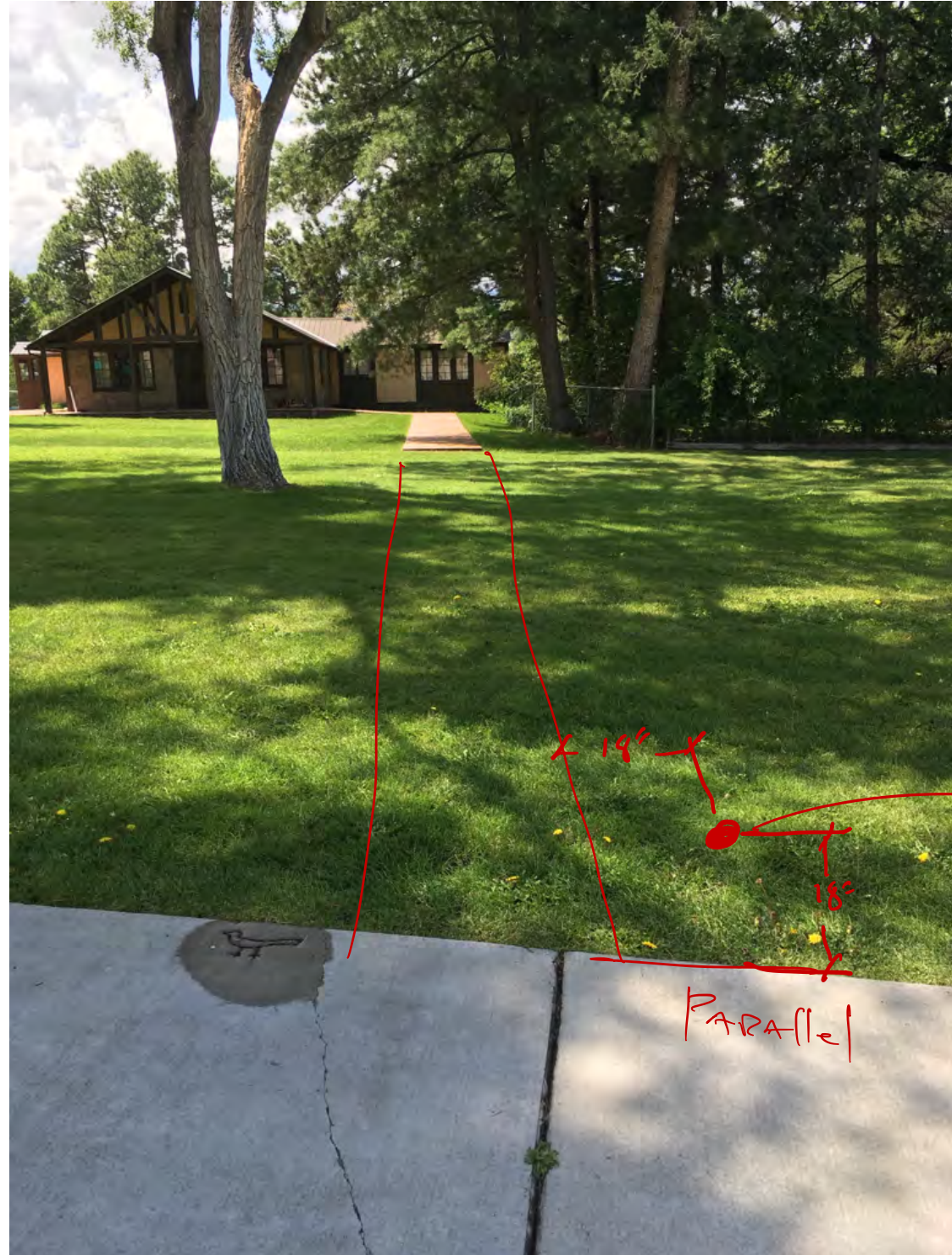
WT.G.07 - Bathtub Row Walking Tour Sign