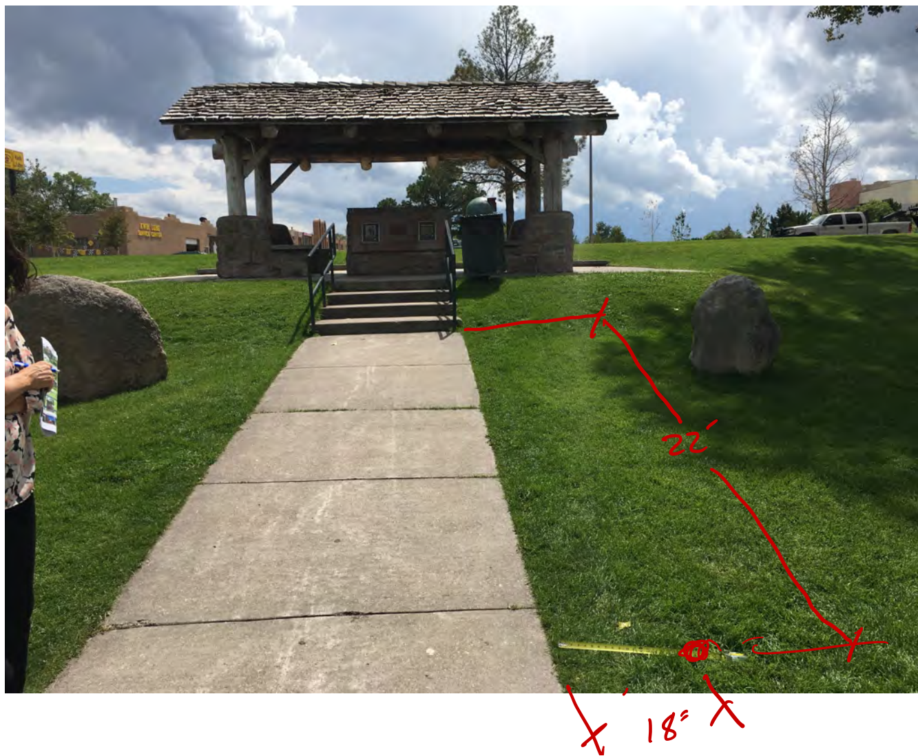
WT.G.10 - Ice House Walking Tour Sign