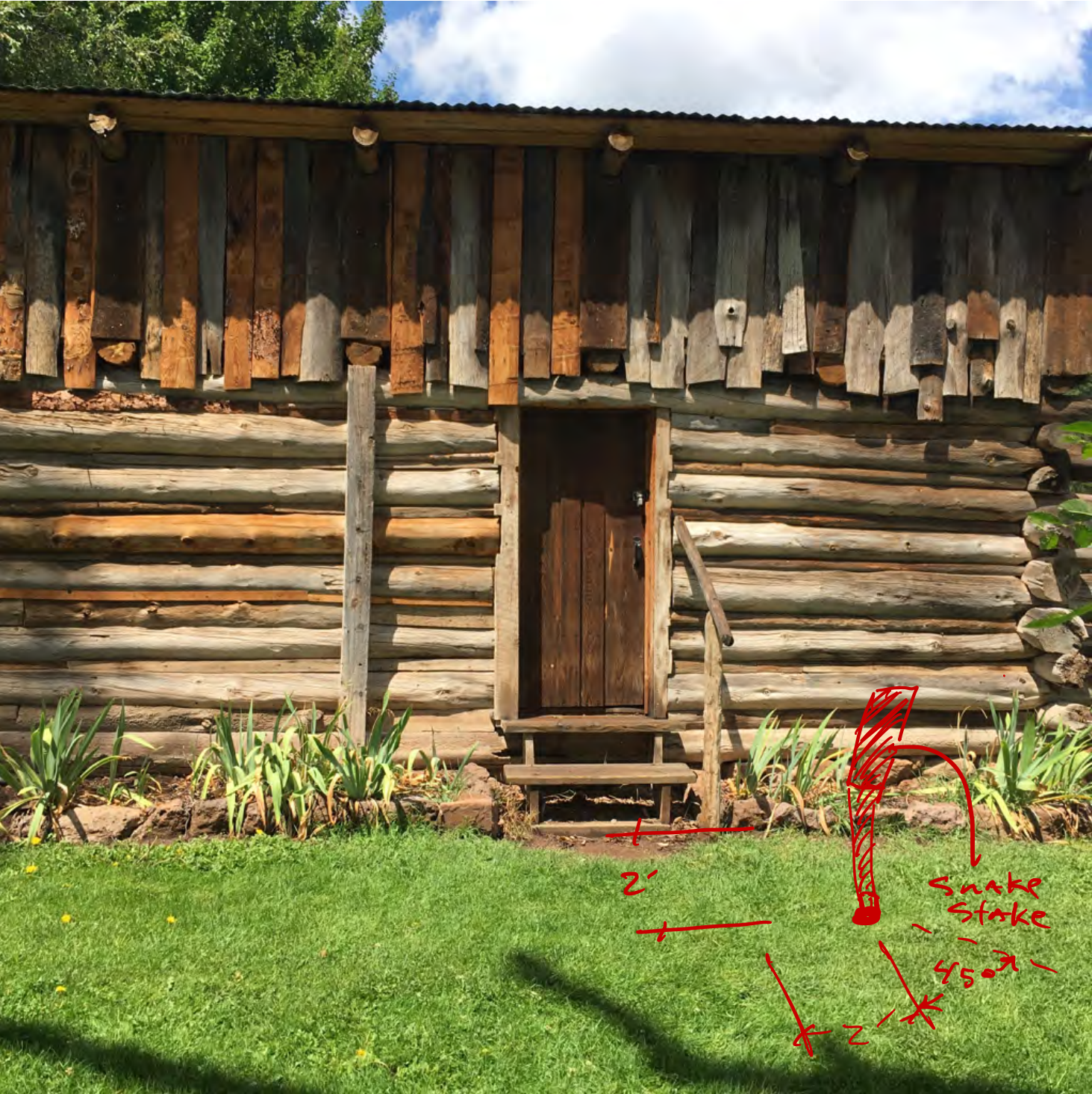
WT.G.03 - Romero Cabin Minor Walking Tour Sign (Snake Stake Sign Holder)