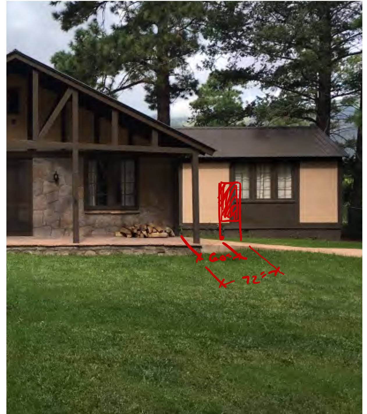
BH.0.1.G.01/WT.G.08 - Bethe House Introduction