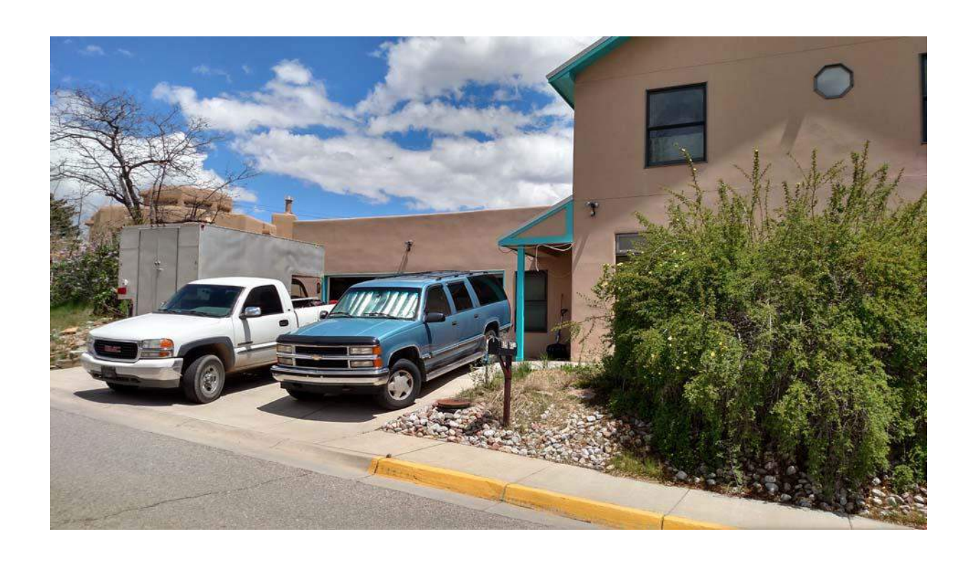
Exhibit VI_Photographs of subject property, Staff (6).compressed.pdf