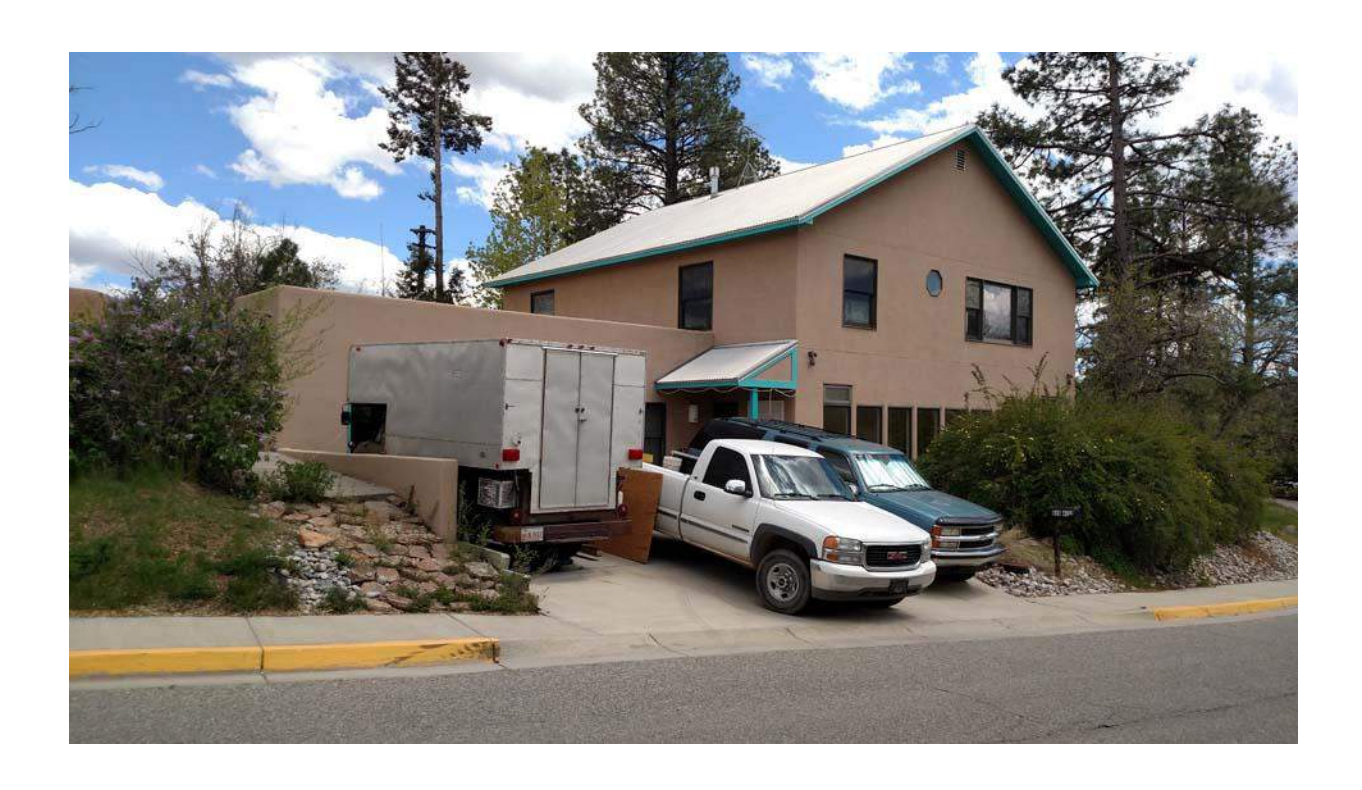
Exhibit VI_Photographs of subject property, Staff (6).compressed.pdf