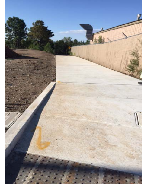
Knecht Street Improvements