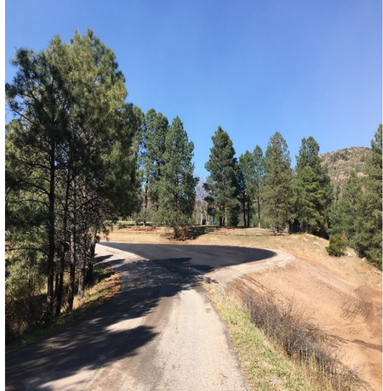
Bus Turn Around at Range Road