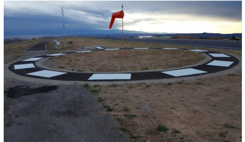
Segmented Circle Rehabilitation