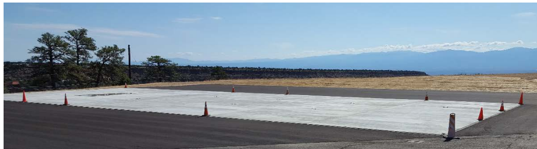
Concrete pad constructed by the DOE