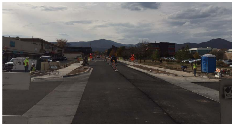
Central Avenue Phase 2 Project