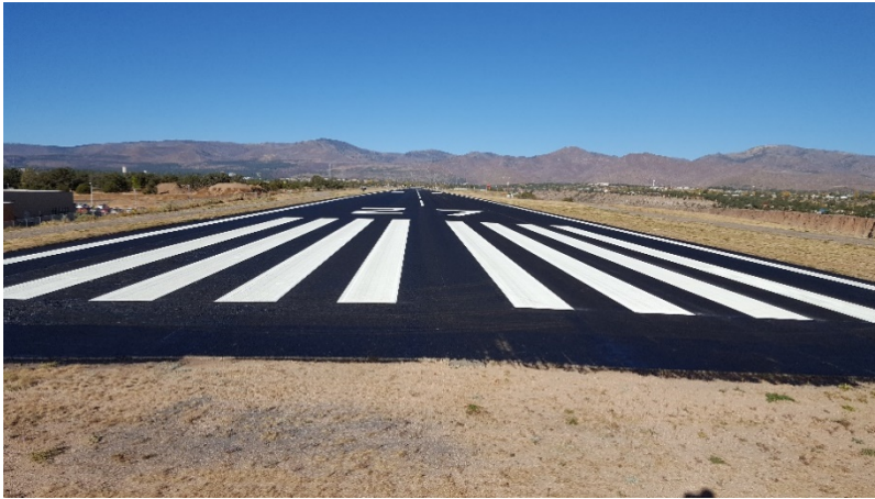
Runway Maintenance Project