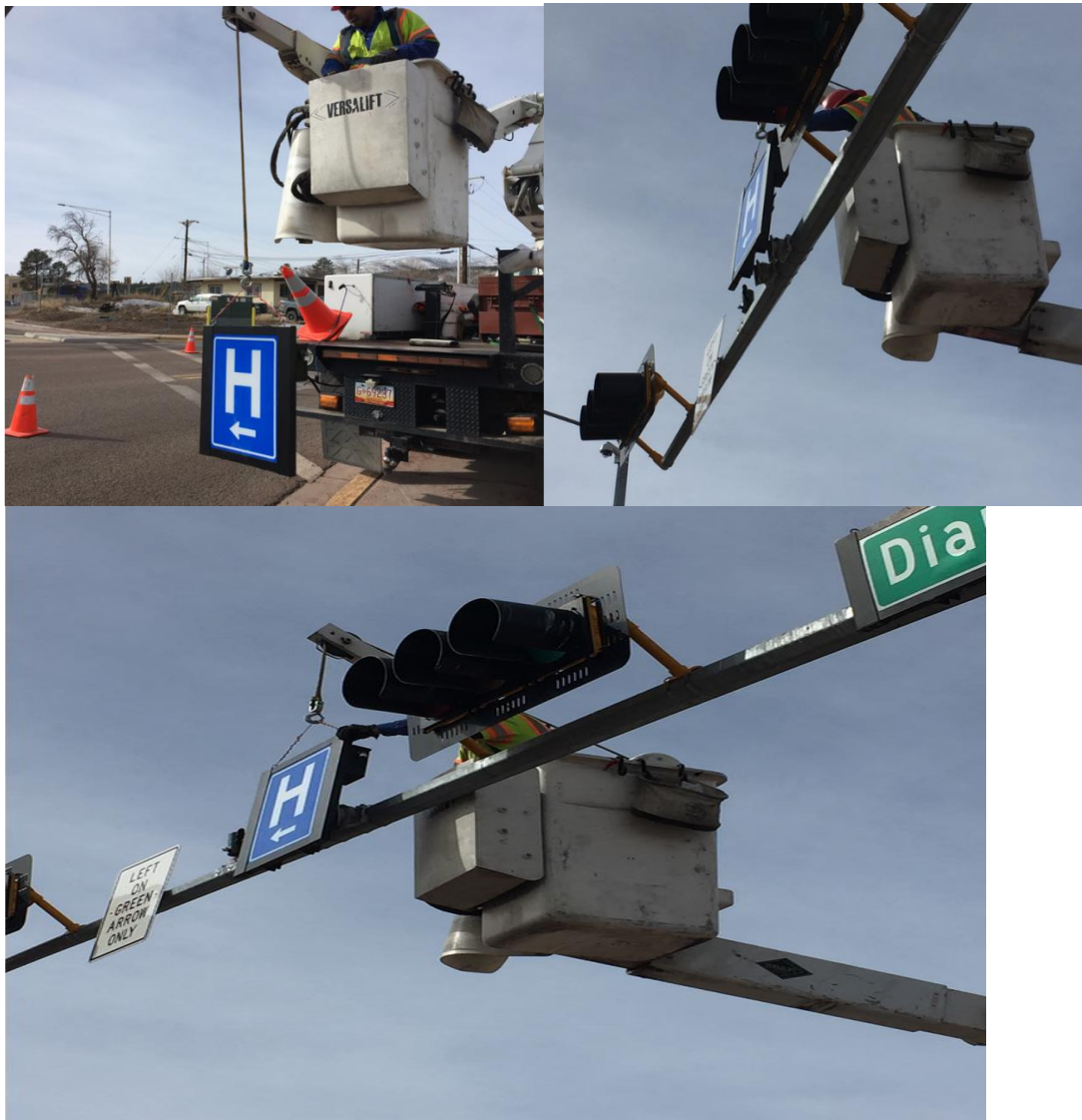
Crews have been installing lighted hospital signs along Diamond Drive.