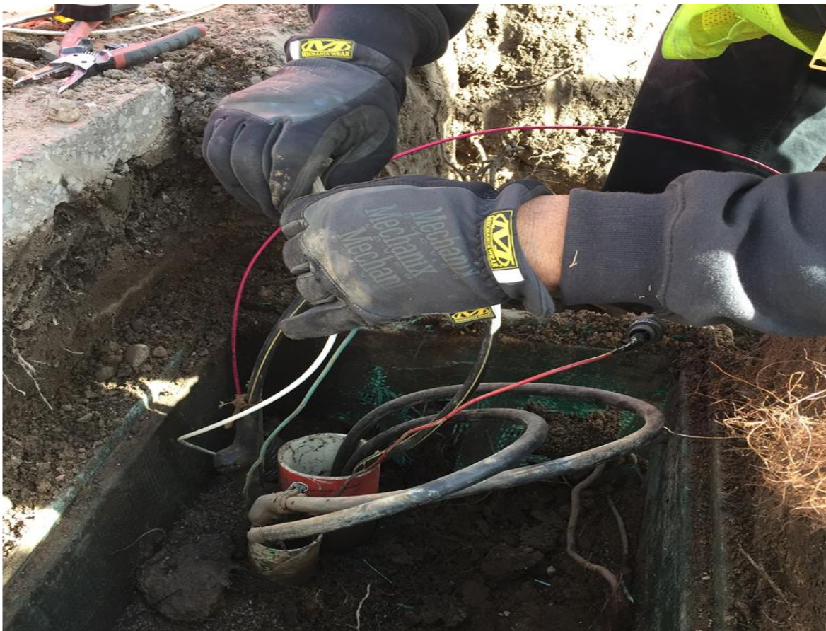
Crews locate a buried pull box to repair a faulted streetlight feed.