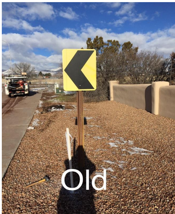
Crews are busy replacing traffic signs countywide.