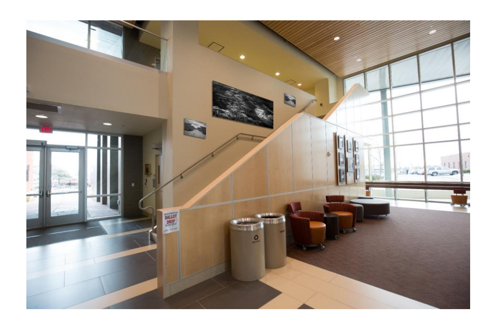
Photo-shopped image of the additional Minesh Bacrania photograph(s) for the lobby staircase