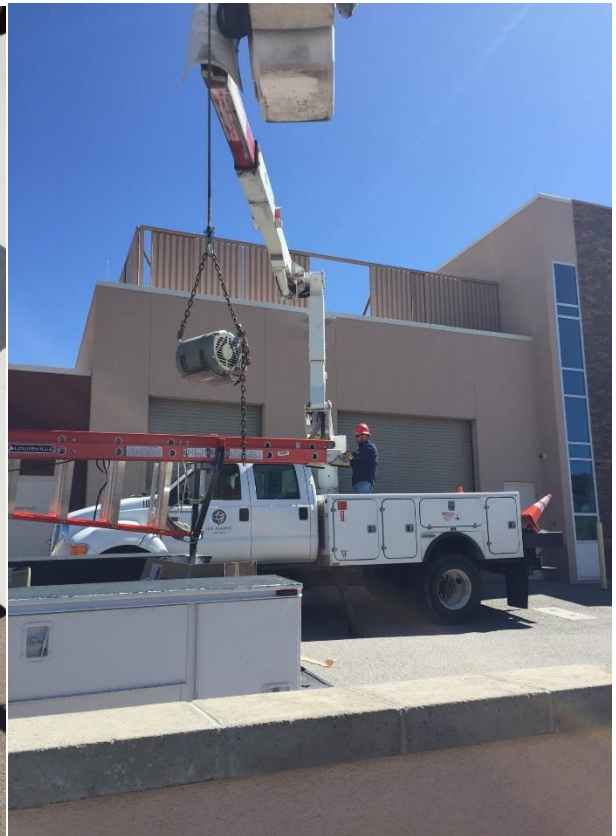
Traffic electricians assisted facilities by lifting a motor to the roof of the Judicial Center.