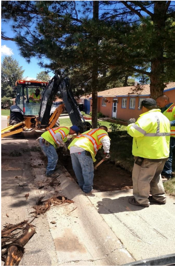
Street crews are seen working on Nugget Street where they removed and replaced a section of sidewalk.