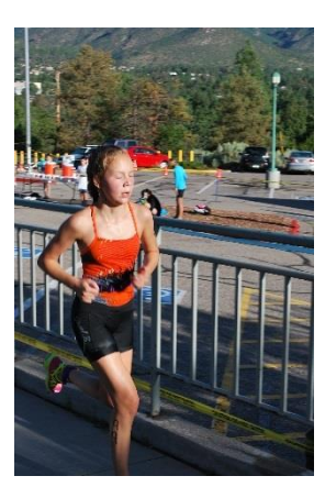
43<sup>rd</sup> Annual Los Alamos Triathlon: 161 Participants, Individuals & Teams, Up 8% from 2016 There were 111 individual participants and 19 relay teams.