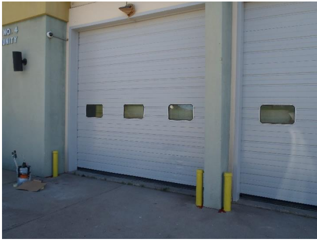
Overhead Doors Painted and Bollards