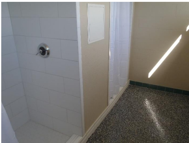
Crew showers after remodeling.