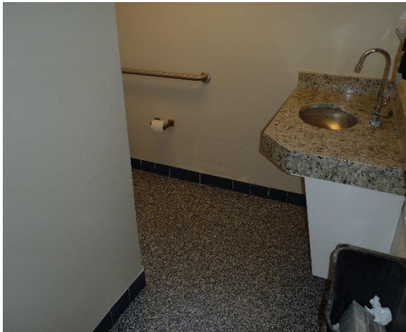
Captain/female sink complete.

A second project at Fire Station 4, the shower replacement project has been completed, by contractor Allied 360. Crews replaced the old plastic shower inserts with new walls and tiles. In addition, the sinks and counter tops were replaced and a new epoxy chip floor was installed.