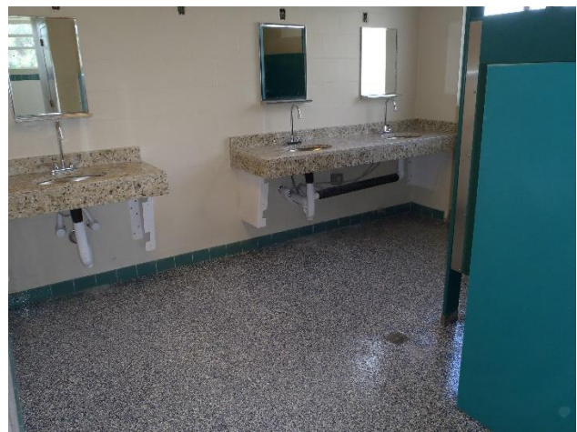
Crew sink complete.