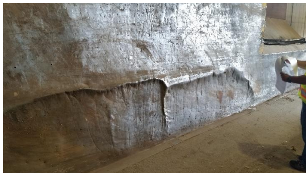
Existing buckled steel.

An on-call contractor Allied 360 has begun work to replace and bolster the existing push wall at the northwest corner within the Transfer Station. The work will consist of the installation of some steel plate augmented by a new concrete support wall. It is anticipated to take approximately 6 weeks.