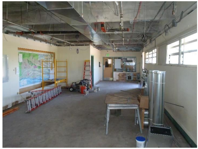
New Ductwork Main Trunk for Dayroom

A second project at Fire Station 4, the shower replacement project has been completed, by contractor Allied 360. Crews replaced the old plastic shower inserts with new walls and tiles. In addition, the sinks and counter tops were replaced and a new epoxy chip floor was installed.