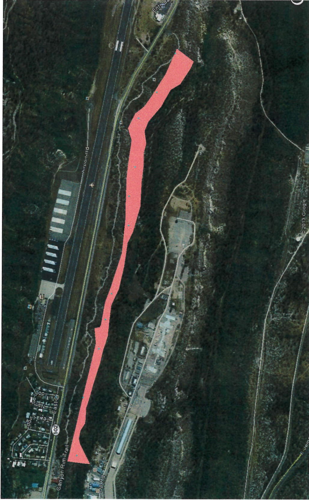
Parcel A-5-2 = 37.31 acres