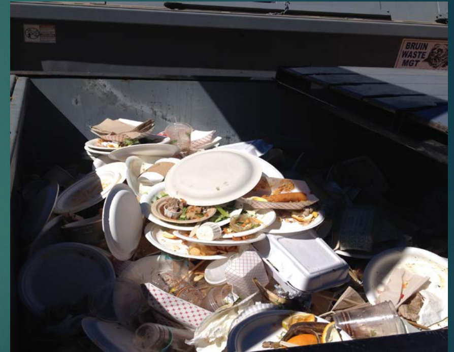
Special Event Food Waste to Compost