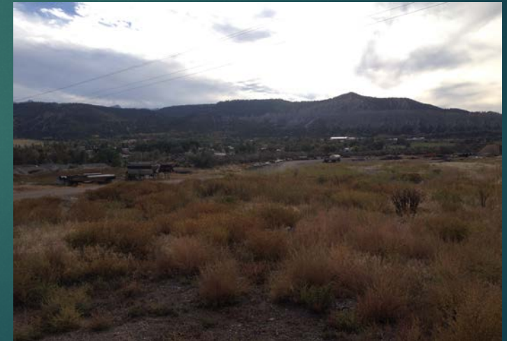
The Old Ouray County Landfill