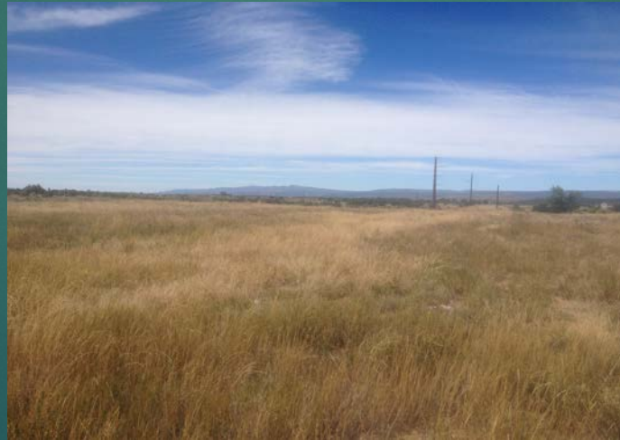
Norwood Transfer Station