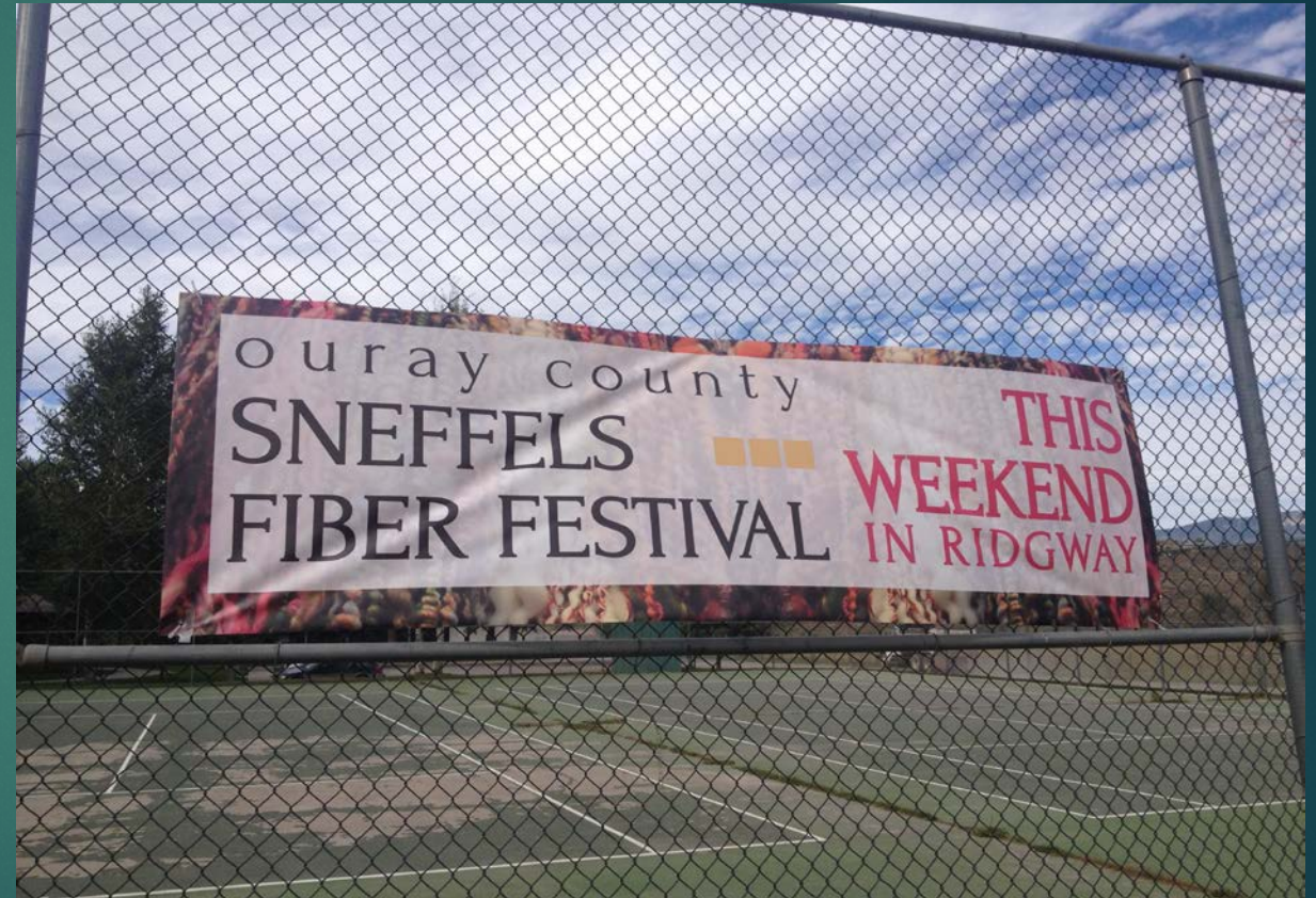
Sneffels Event Partner