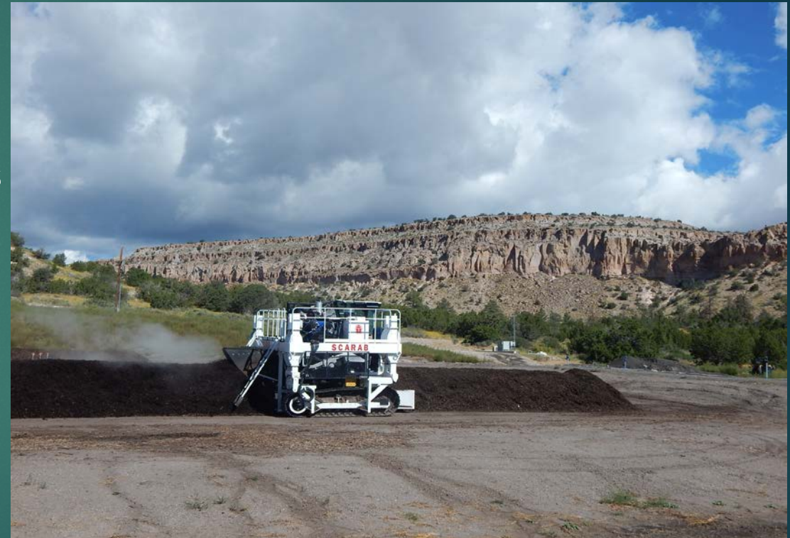
Windrow Composting with Turner