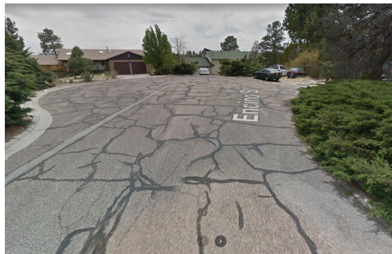
Encino St. Before