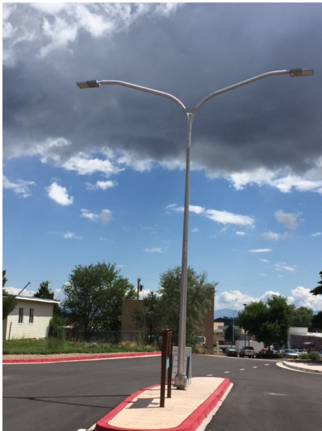
Traffic Crews installed a new double arm light pole at 40 th Street and University on August 23 rd .