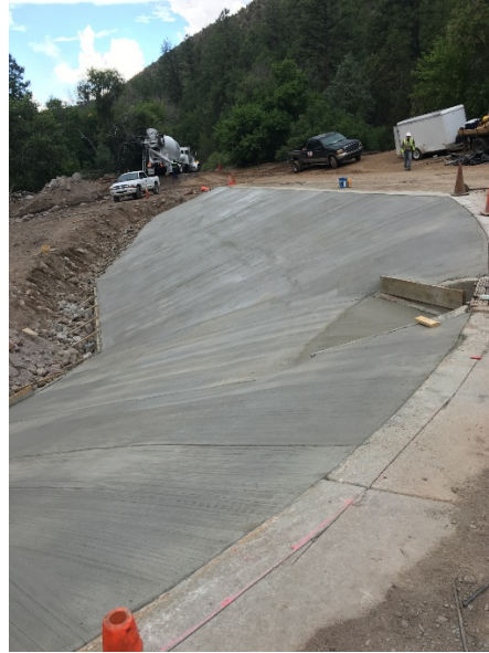
Before and after images of the rebar setting and concrete pour.