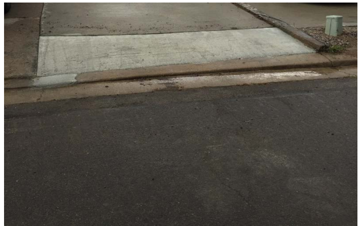
Before and after images at 1312 Sage. There was a utility line break, Streets Crews repaired the drive pad at the entrance.