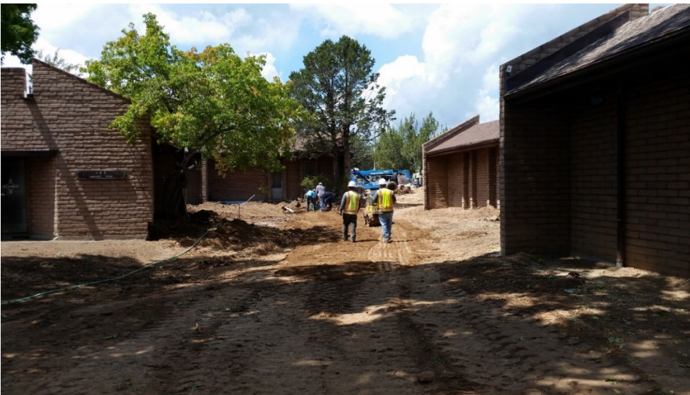
Court Yard Grading