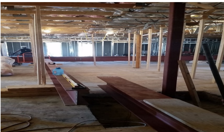
Senior Center Interior

Knecht Street Improvements including construction of a 10 ft. wide connection to the Canyon Rim Trail are substantially complete. Manufacture, delivery and installation of two street lights and completion of punch list items will wrap up the project.