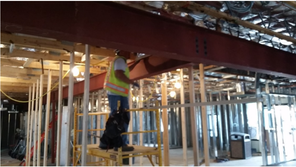
Town Hall Interior