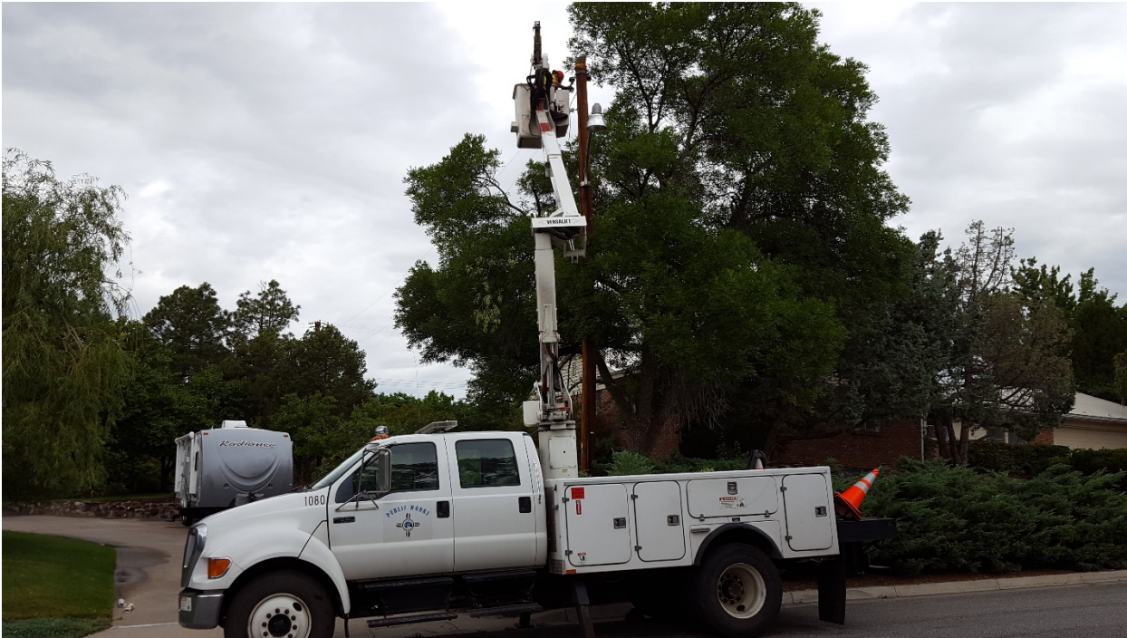
Traffic Crews remove sag from overhead conductors at 277 Andanada. Crews trimmed the trees and moved the wiring.