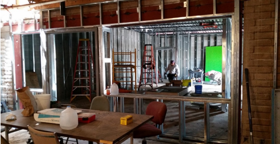
Meal Center/Kitchen Interior

Crews with R&M Construction continue to make steady progress on renovations, which include installation of interior structural supports, wall framing, insulation and drywall; plumbing, HVAC ductwork, and electrical rough-ins; and window and door installations; Repairs to the building foundations are complete and courtyard storm sewer installation and grading is ongoing.