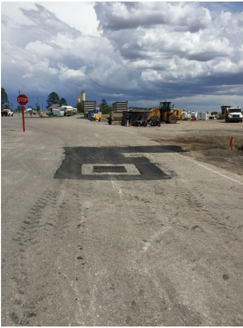
Streets Crews repaired a patch of failing asphalt around a drain at the Eco Station.