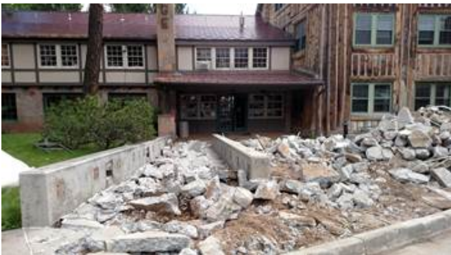
Fuller Lodge Main (west) Entrance

Work started on the main entrance (west side) to Fuller Lodge with replacement of the concrete and flagstone. This necessitated the closing of this entrance with a planned completion date of October 1. In the meantime visitors will be using the east entrance off the patio.