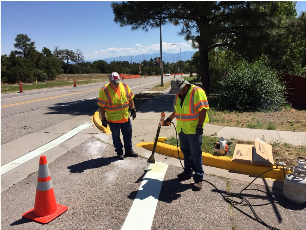
Traffic Crews eradicating and replacing crosswalks throughout the County.