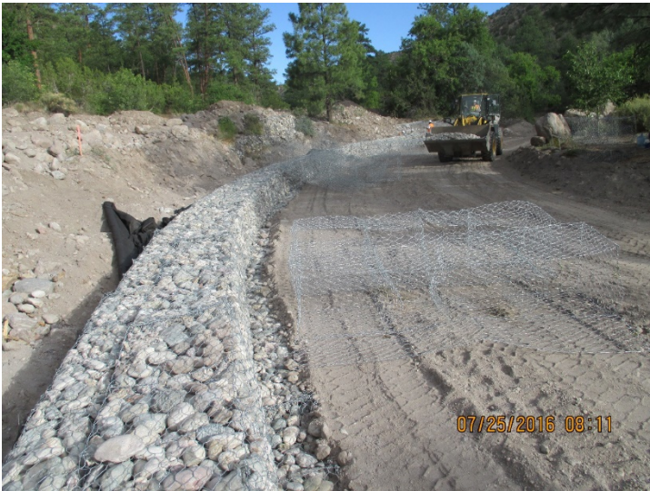
Placement of gabions along roadway.

Guaje Canyon Mitigation Project reached substantial completion on Friday, August 19, 2016 and is 99% complete.