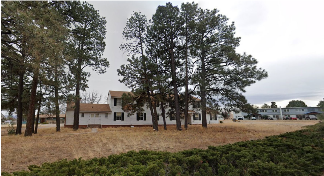
Image 1: Google Earth Street Image, Dec. 2022 – Women's Dorm Building west elevation facing 18 th Street

See Attachment A: Application Submittal.