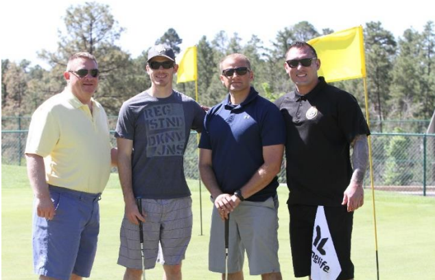
New Mexico Seniors (ABQ) came to enjoy Los Alamos – May 21 st 2018, 38 players: