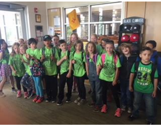
Young Life Charity – May 18 th , 2018, 35 players played to help raise funds scholarships: