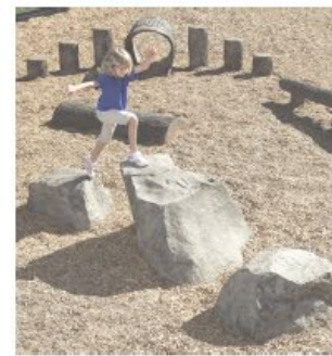
10 BOULDER STEPPERS