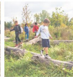
15 LOG CROSSING