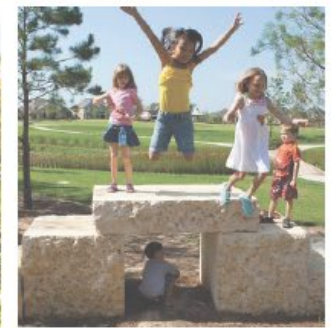
16 TABULAR BOULDER BRIDGE