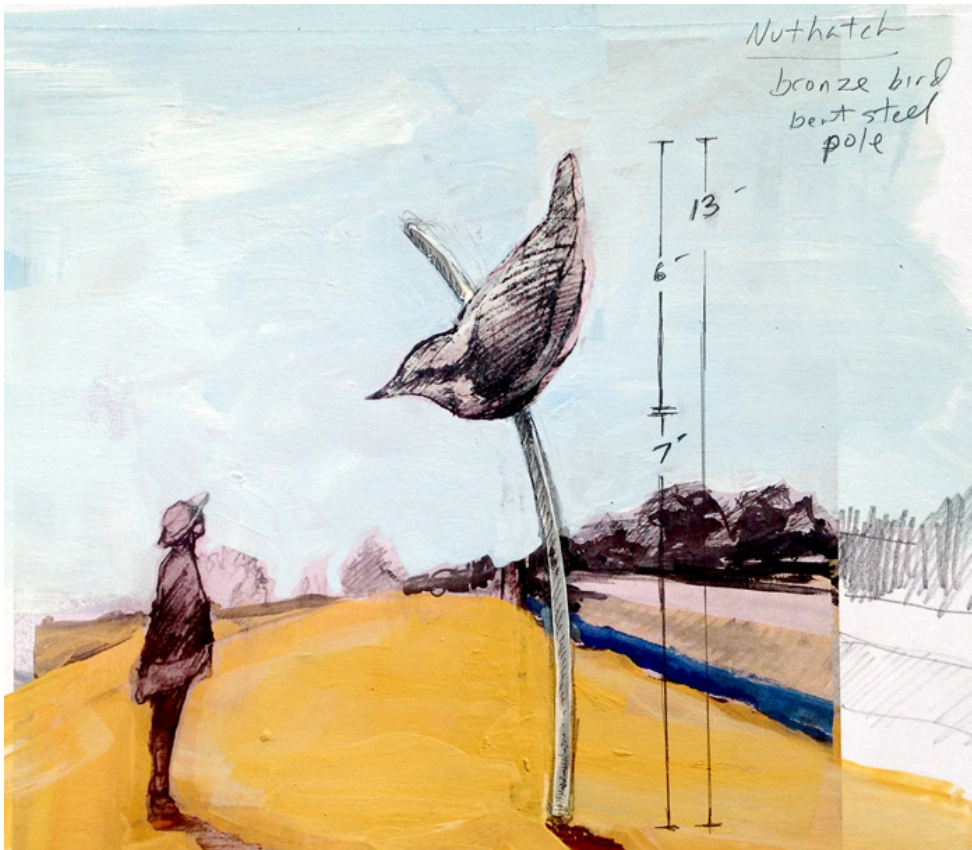
Illustration for Nuthatch Sculpture ( watercolor )