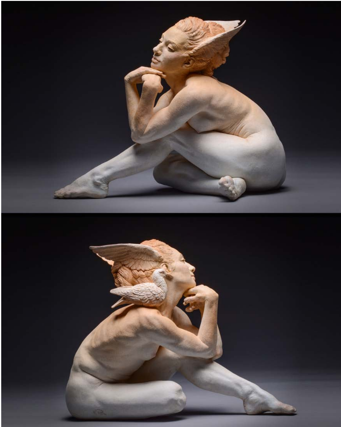
10. Dove Dreams of Flying 2022, Fired clay, 18"x 15"x 24" Private Collection $9500

This Imaginative Realist sculpture is a personal piece created for a Beautiful Bizarre Magazine curated show in San Francisco. She shows our sculptural ability to create expression and connection between human and animal.