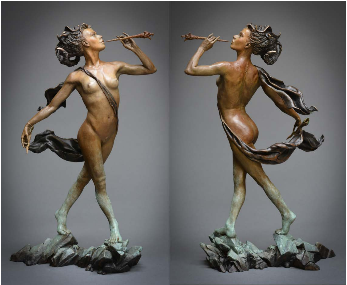
9. The Twins Kythos: Gathering the Dusk 2023, Bronze, 21"x 13"x 8", Raleigh, NC Private Collection $7900

"Gathering the Dusk" is one of our personal pieces based on stories from an original mythology we're writing. This sculpture demonstrates our sculpting abilities, anatomical knowledge and visual storytelling as well as creative patina application (the coloration of the bronze). She is the twin sister of "Dawn." She is playing the aulos, or twin pipes, coaxing the shadows to flow together into the nighttime ribbon that wraps around her. Her pipes are in the shape of creatures of the evening, the fox and the nightingale.