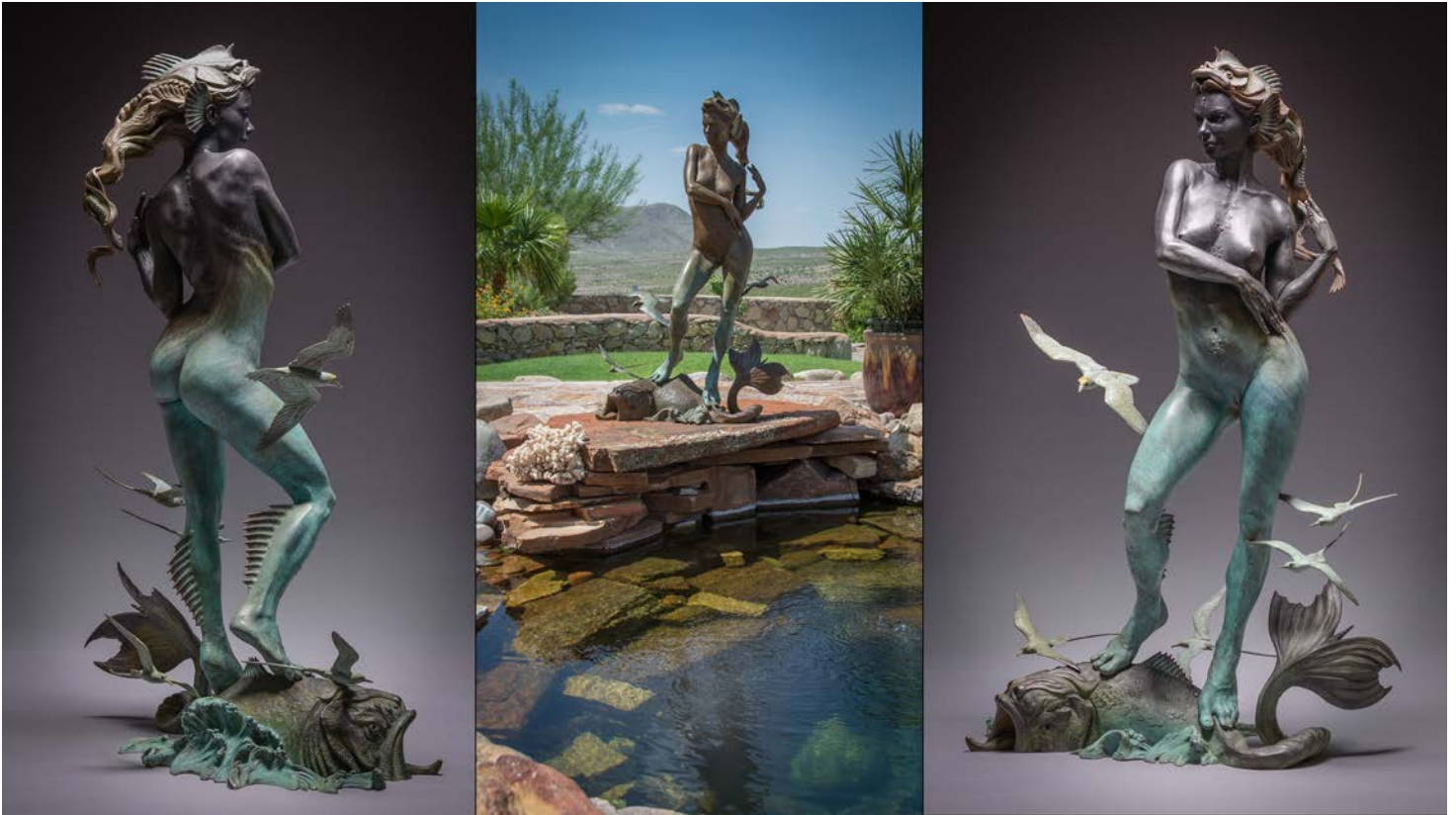
6. The Wind in the Waves 2020, bronze, 48"x 30"x 15", Las Cruces, NM $36,000

"Wind in the Waves" is one of our personal pieces based on stories from an original mythology we're writing. We've included several reference pieces from our personal works as examples of our background in sculpting accurate detail and anatomy, which often can be hidden from view under fur and feathers. The human form is complex and challenging. We have found that, much like learning your scales in music, the discipline involved and the skills developed in learning to sculpt the figure accurately translates to the capability to be able to sculpt anything.