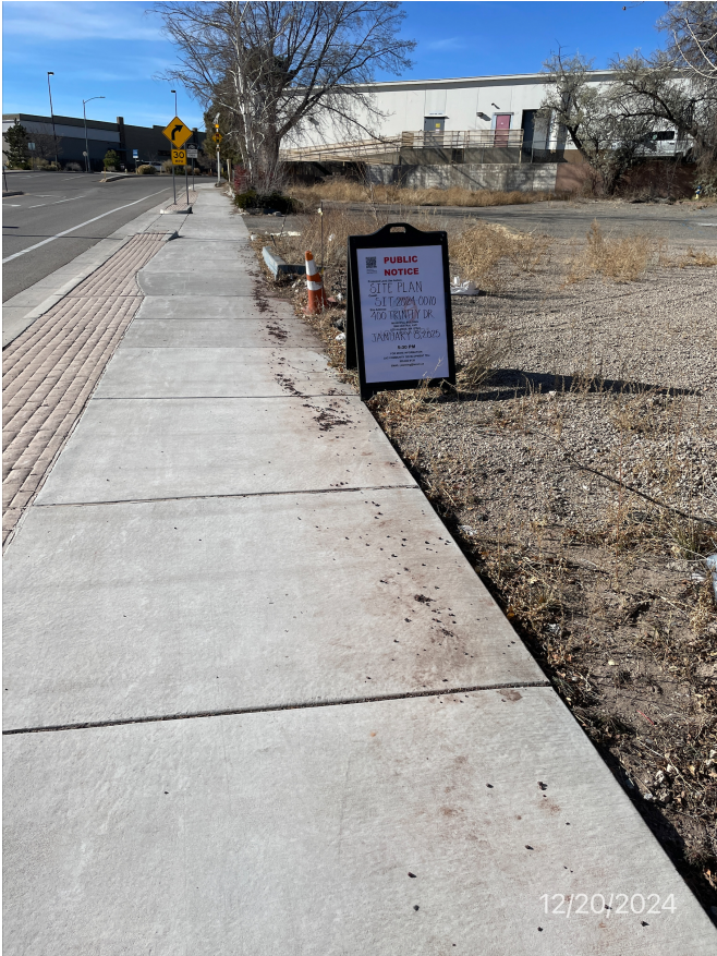
Posted along Trinity Drive on December 20, 2024