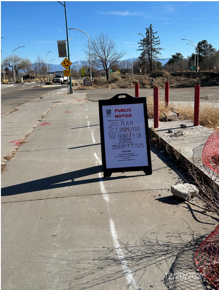
Posted along Central Ave on December 20, 2024