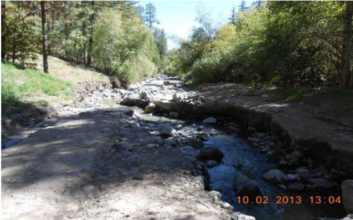
Road becomes Creek after 2013 flood event

Consequently, increased runoff created an enormous amount of erosion in Los Alamos Canyon that continues to contribute hundreds of yards of sediment each year to the Creek. The channel in the upper watershed is extremely destabilized, with areas of deep gullying, headcutting and bank erosion. The channel below the reservoir is also destabilized, with some portions of the Creek now being at a higher elevation than the road, lengthy gullies, and piles of sediment that have been deposited upon the floodplain.