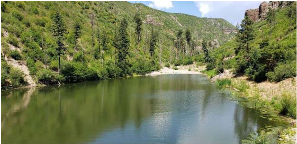
Looking upstream at fan entering reservoir, Los Alamos County intends to enhance this recreational resource by restoring upstream watershed including revegetation of fan