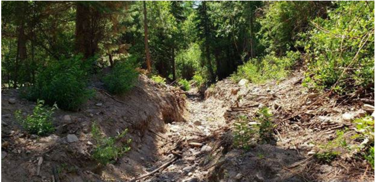
Impaired channel of Los Alamos Canyon Creek, eroding banks contribute sediment downstream