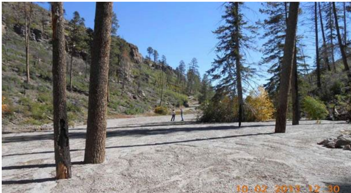
Looking upstream from Reservoir after 2013 flood event, no channel visible

This flood caused the deposition of 15,000 yards of sediment in the Los Alamos Reservoir, and moved about 4000 yards of soil from the reservoir access road and deposited it downstream in the impaired reach between the LANL boundary and DP canyon. This flood caused extreme amounts of damage to the watershed including headcutting, channel evulsion, gullyng, and deposition of debris fans.