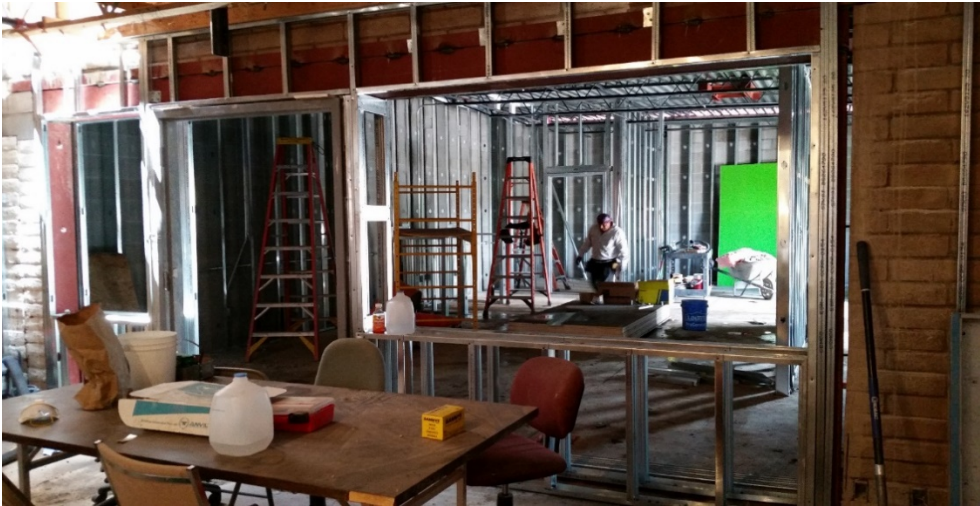
Meal Center/Kitchen Interior

Crews with R&M Construction continue to make steady progress on renovations, which include installation of interior structural supports, wall framing, insulation and drywall; plumbing, HVAC ductwork, and electrical rough-ins; and window and door installations; Repairs to the building foundations are complete and courtyard storm sewer installation and grading is ongoing.