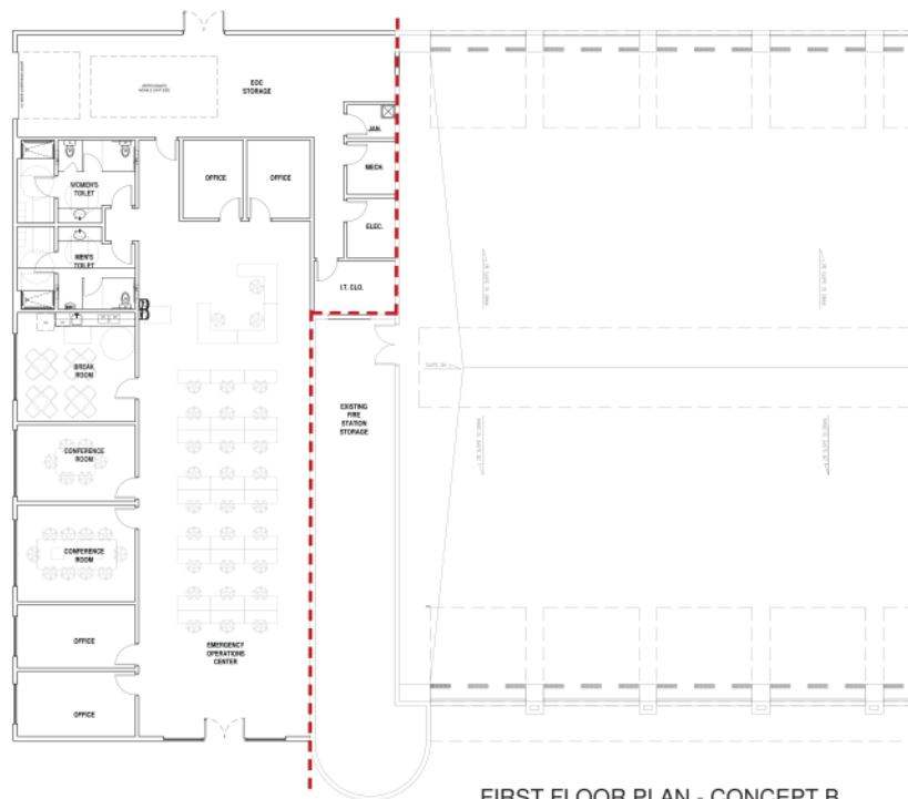
FIRST FLOOR PLAN - CONCEPT B