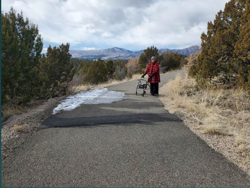
Canyon Rim Trail (2.5 mi)