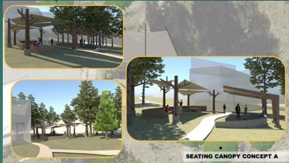
Planned accessible outdoor space at the library