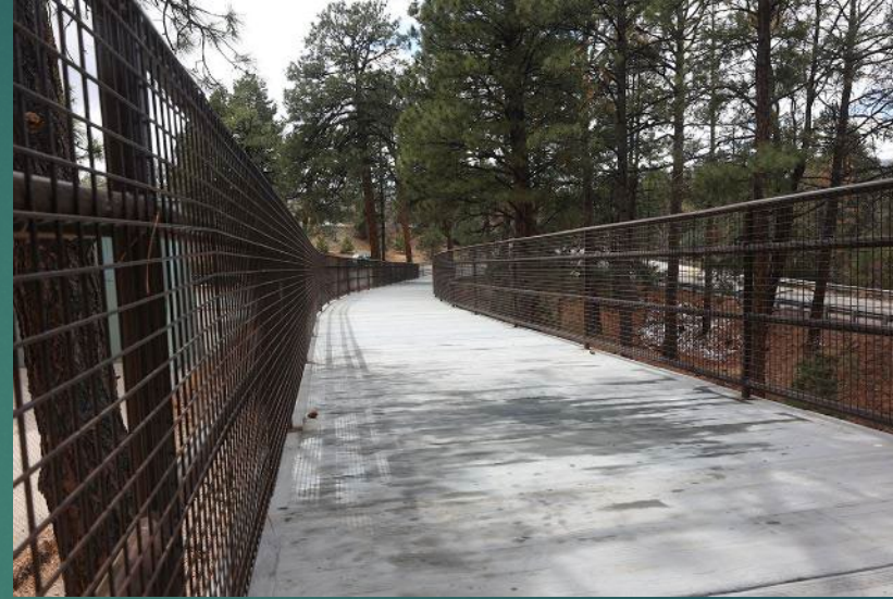
Urban Trail (.8 mi)