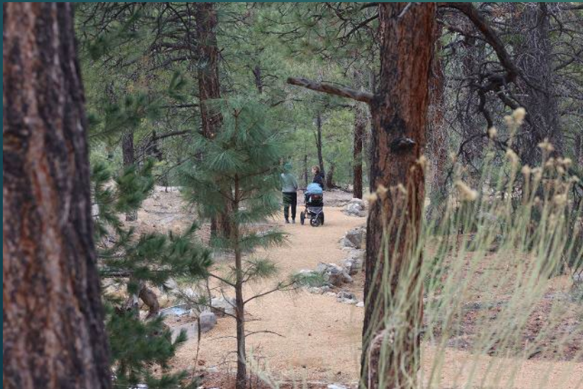
Kinnikinnik Park Trail (.25 mi)