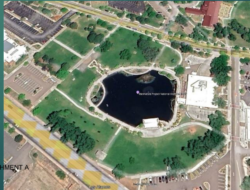
Ashley Pond (.16 mi)