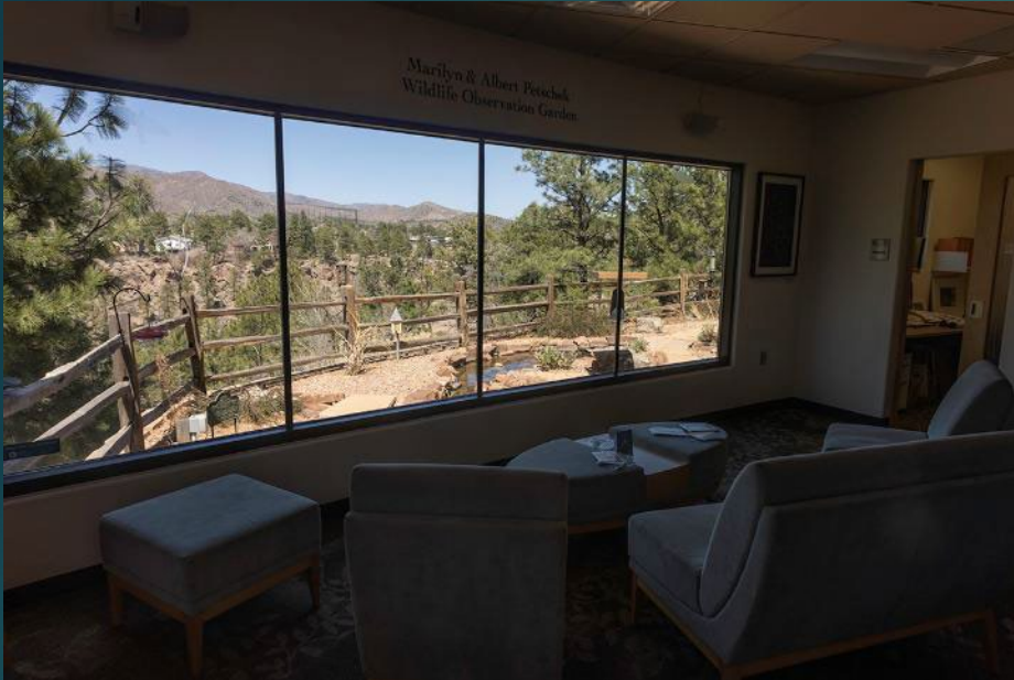
Accessible indoor space