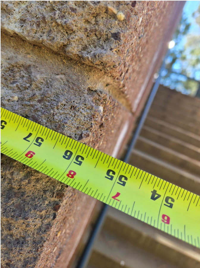
Width: Maximum of 55.75 inches