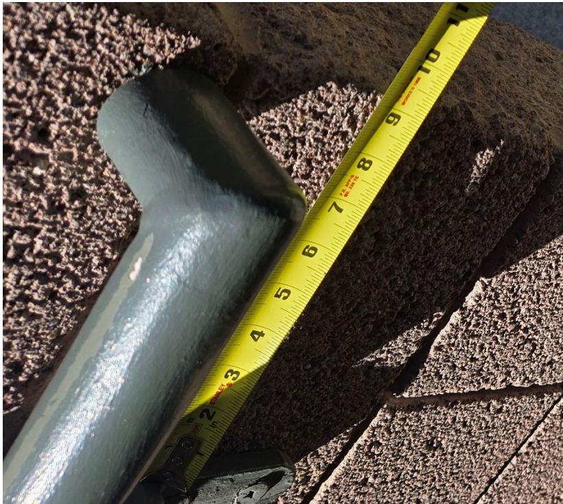
Depth: Maximum of 9 inches