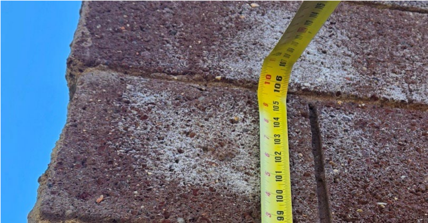
Height: 106 inches