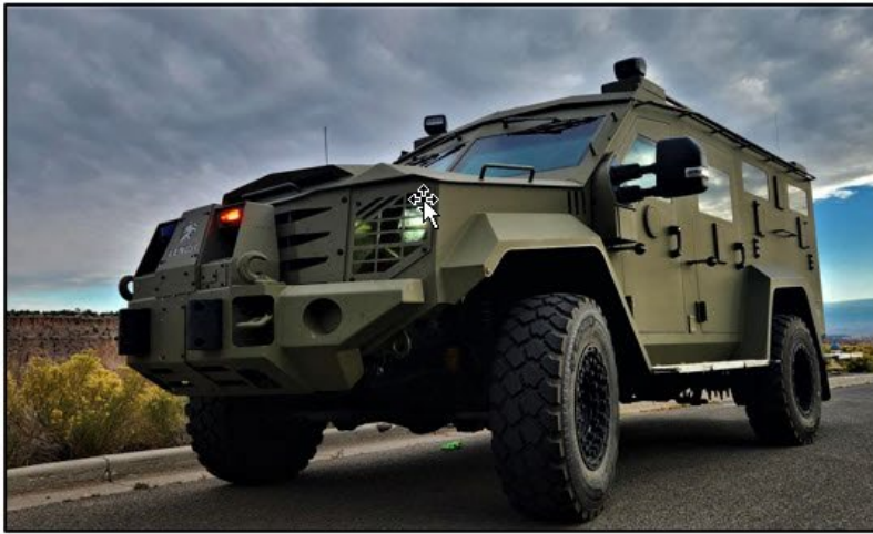
Bearcat – Armored vehicle was received for the Police Department