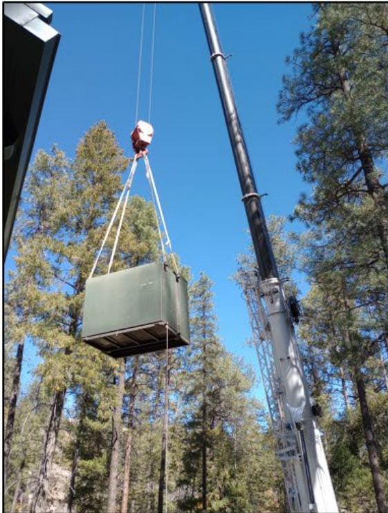
Installation of Temporary Ice Chiller