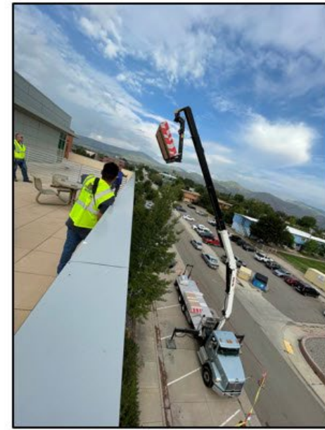
Material delivered for CMO/Finance remodel