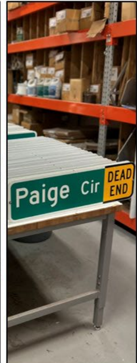
Sign Replacement Project