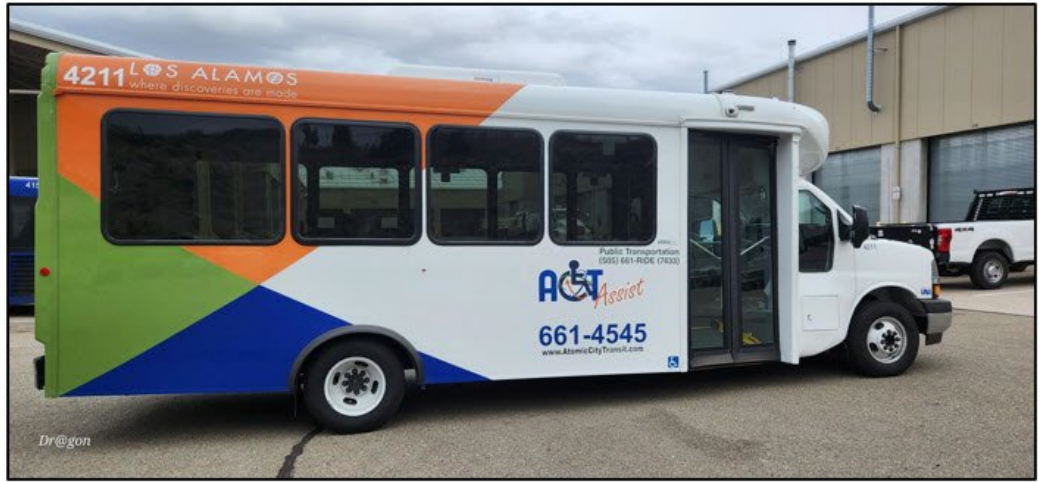
ACT Assist provides ADA complementary paratransit service.