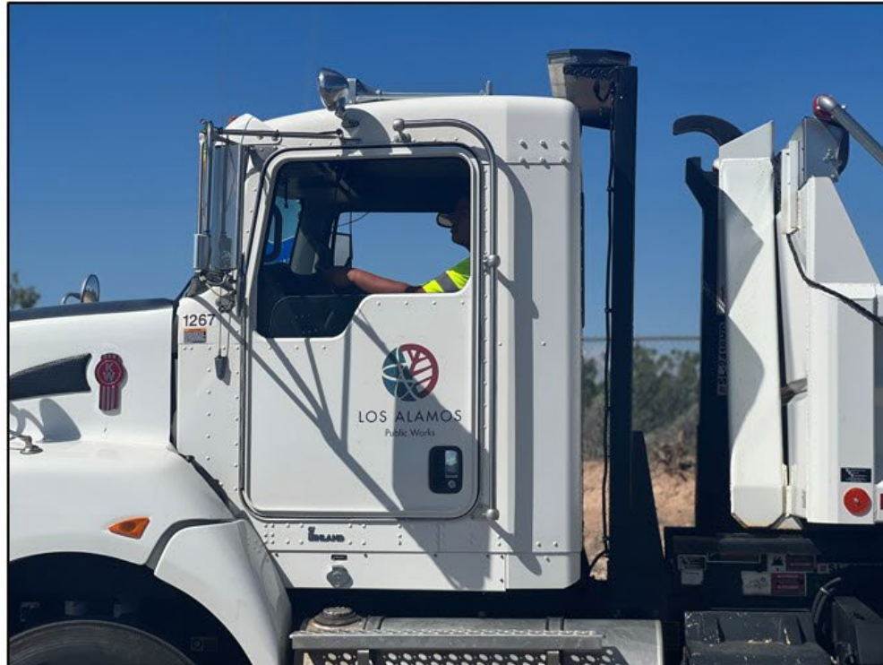
Commercial Drivers License (CDL) Testing is provided in house ATTACHMENT E