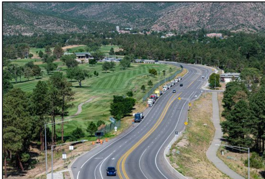
North Mesa Mill and Overlay Project