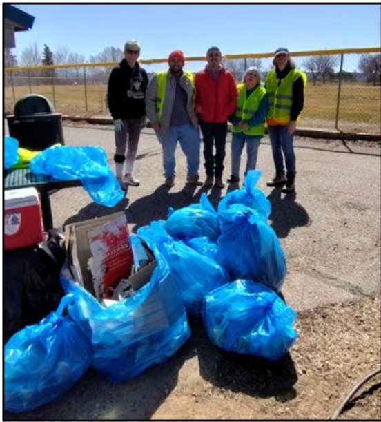
Adopt-A-Road Cleanup Event in White Rock