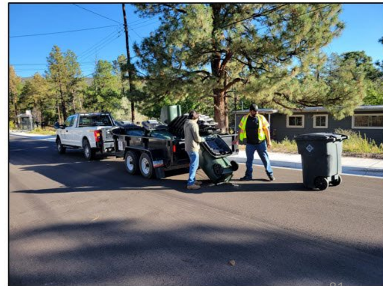
Bear cart delivery