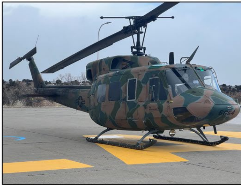
Air Force helicopter visits KLAM