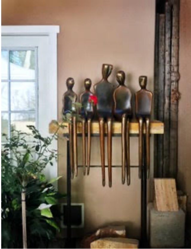
Family of 5