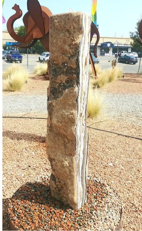
“Black Canyon Falls”