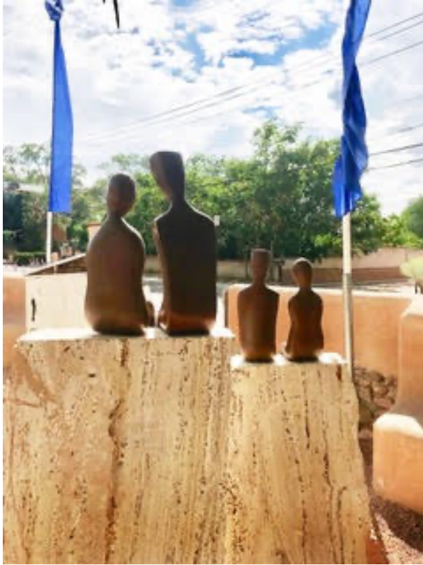
Tiered Family (back)