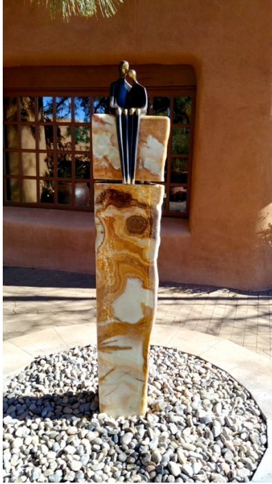
Piece in collaboration with Yenny Cocq