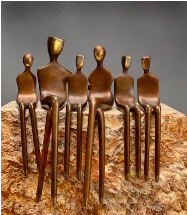
Family of 6