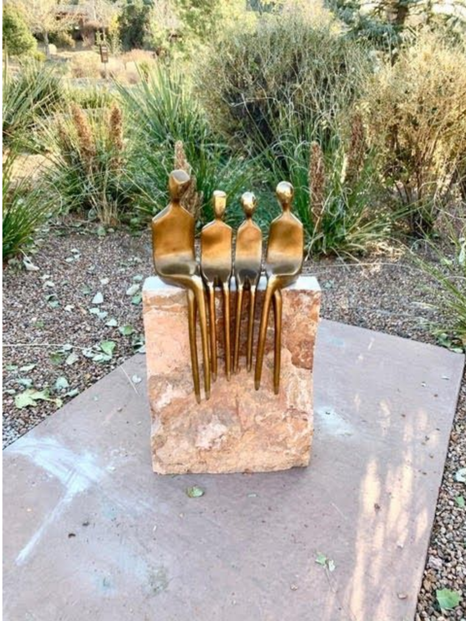
Yenny Cocq bronze family of 4