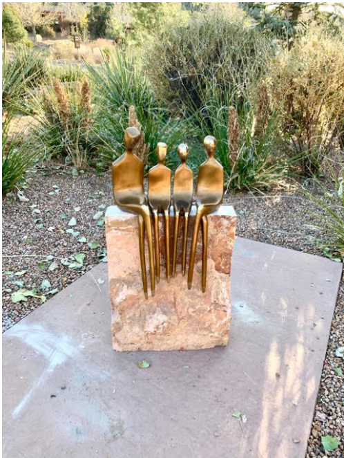
Family of Four_Four Seasons