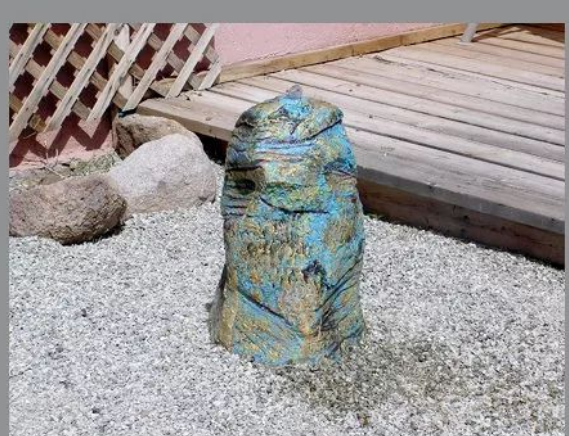
Outdoor Rock Fountain "Blue & Red Stone" 21" x 15" Eric Brown