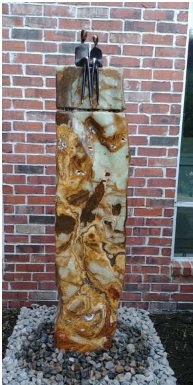
Yenny Cocq bronze couple mounted on Greg Robertson stone fountain