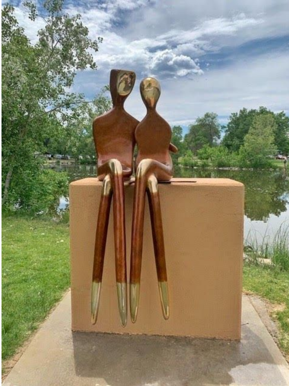
Yenny Cocq bronze couple located in Loveland, CO