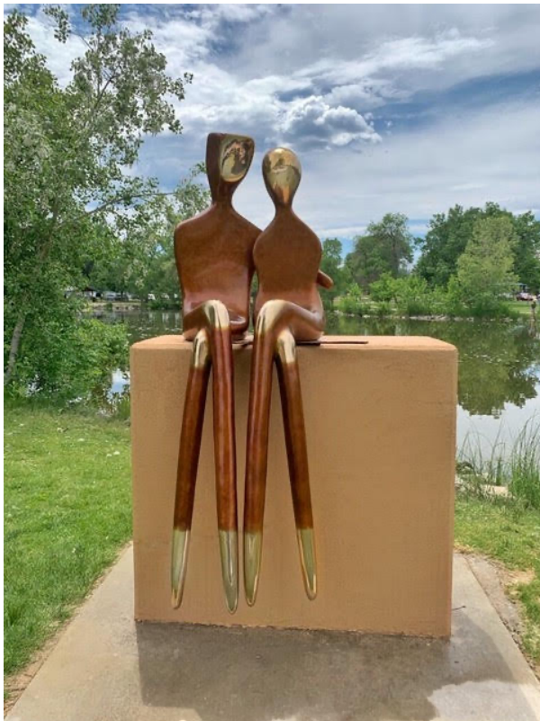
Loveland, CO_Public Art