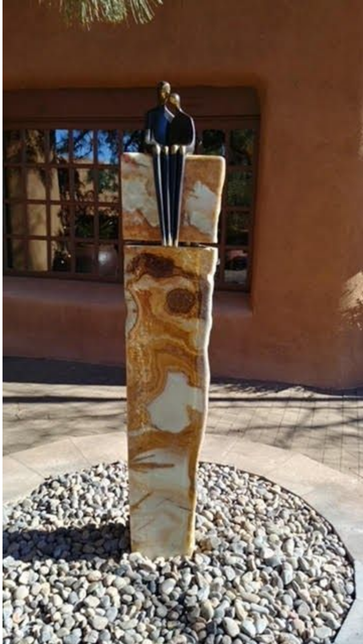
Yenny Cocq bronze couple mounted on Greg Robertson stone fountain