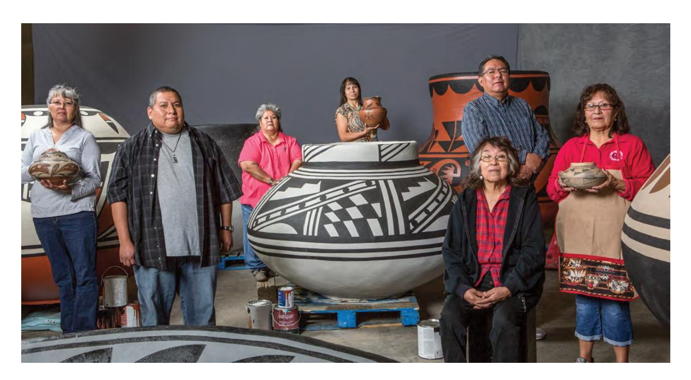
An image of the subject print.