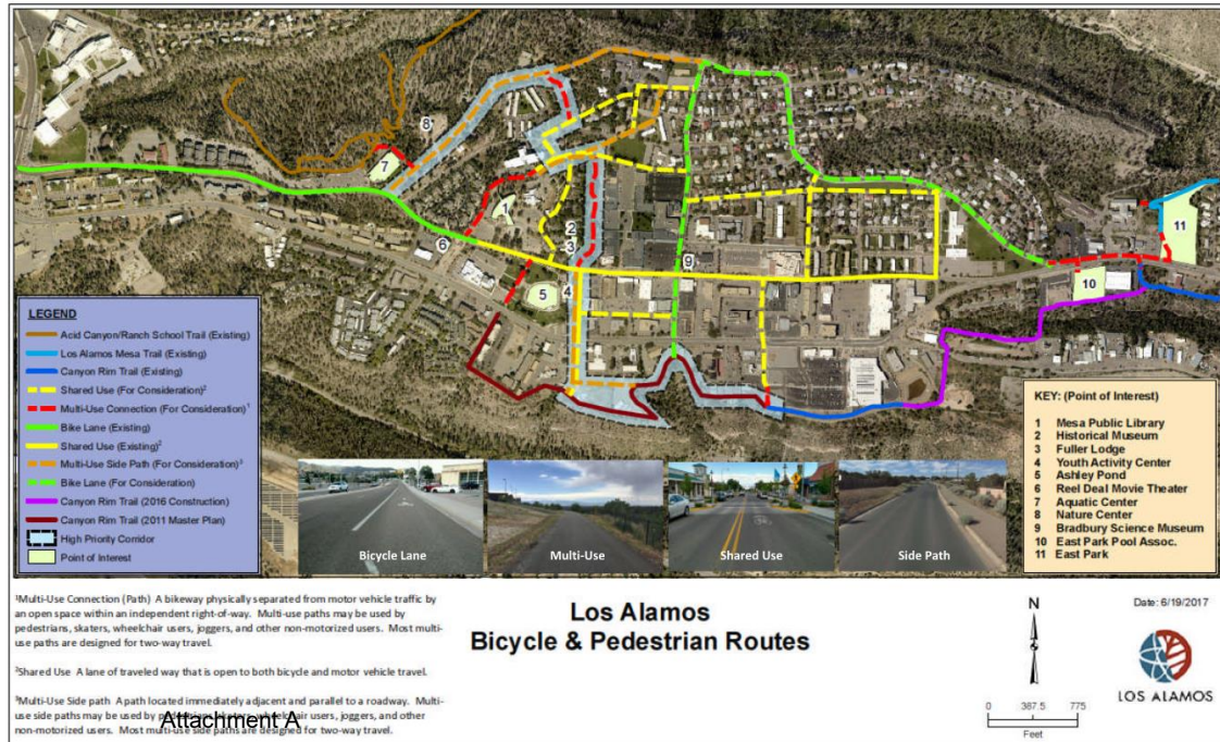
Exhibit C: Los Alamos Bicycle & Pedestrian Routes Map (Priority Corridor)