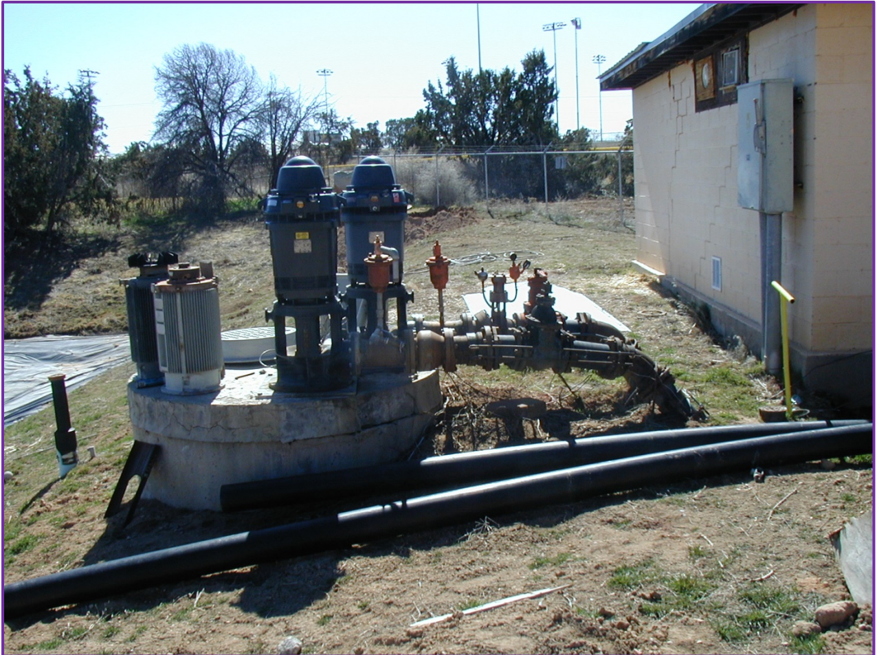
Photo of existing booster pumps installed in 1982.