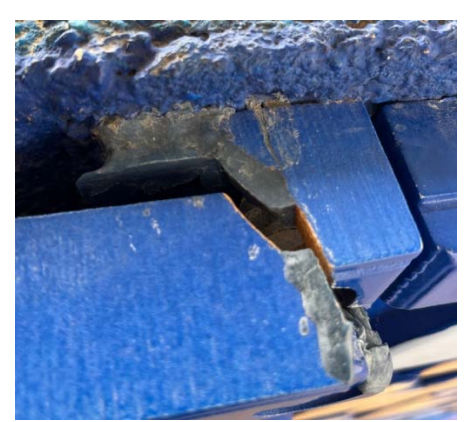
Detail: Before Treatment

2. Pinon Maze (41) had separated from the wall. The sculpture was repaired. However, if the wood is warped, the epoxy repair may not hold. The sculpture will be assessed and if it is not stable, a new treatment protocol will be created in 2025. For treatment, old adhesive was removed from the previous repair. The edges were cleaned, then glued back together with an architectural epoxy and clamped overnight.