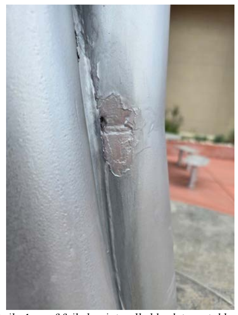
Detail: Area of failed paint pulled back to a stable point and then painted.

Additionally, several other sculptures had some form of conservation treatment or testing to prepare for later conservation treatment.