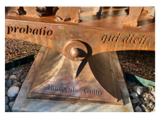
Detail: Front face of Base of The Scale of Justice After Treatment

10. Multiverse (05) Once the sculpture was cleaned, using a soft copper brush, green corrosion was gently reduced along the bottom edges of the panels. Permalac was brushed along the edges where corrosion was reduced.