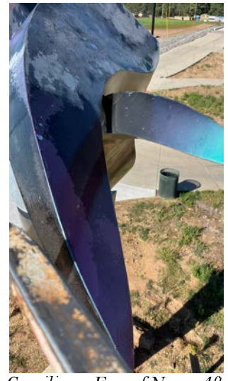
Detail: Top Curvilinear Face of Nexus After Treatment

15. White Rock Pottery Project (33) Pot #6 was heavily cracked. Cathedral Stone Jahn Injection Mortar M30-#31 was injected into cracks that were larger than a hairline fracture. The fills were consolidated with clear potassium silicate then painted to match with Golden® acrylic paints mixed with microbaloons to matte the surface sheen.