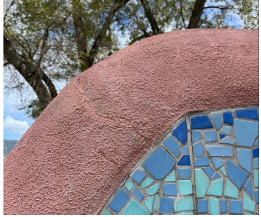
Detail: PR Before Treatment