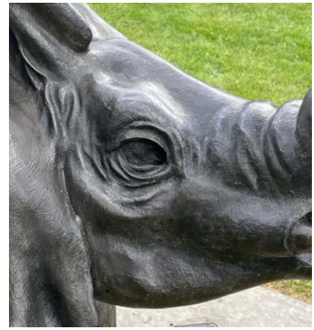
Detail: PR eye and face of Lucky After Treatment

6. Brown Trout (02) has a blanched coating that if removed and replaced will look significantly better. Testing was done with lacquer and varnish over the failing clear coat to determine if the sculpture may be coated without removing the flaking clear coat. The testing is being allowed to sit for a year to see if any issues (lifting, flaking, discoloration) may occur over time. If successful, the sculpture will be coated in 2025 with the appropriate coating. If unsuccessful, the old coating will need to be removed prior to applying a new coating, this may be done in 2025 if time allows.