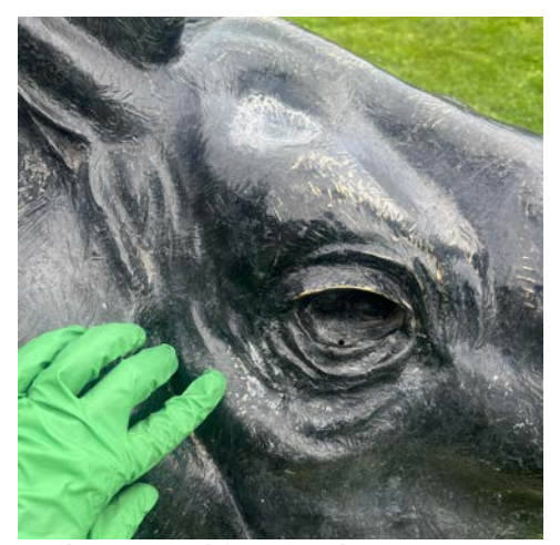
Detail: PR eye and face of Lucky Before Treatment