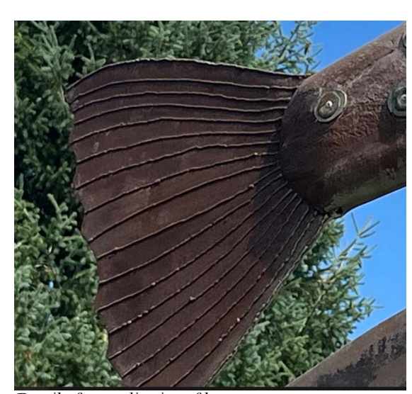
Detail after application of lacquer.