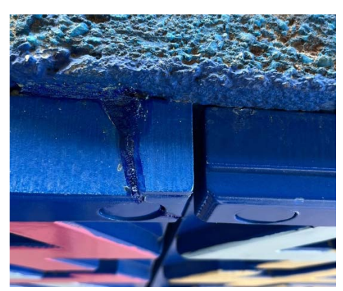
Detail: After Treatment