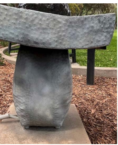
Detail: After Treatment

2. Pinon Maze (41) had separated from the wall. The sculpture was repaired. However, if the wood is warped, the epoxy repair may not hold. The sculpture will be assessed and if it is not stable, a new treatment protocol will be created in 2025. For treatment, old adhesive was removed from the previous repair. The edges were cleaned, then glued back together with an architectural epoxy and clamped overnight.