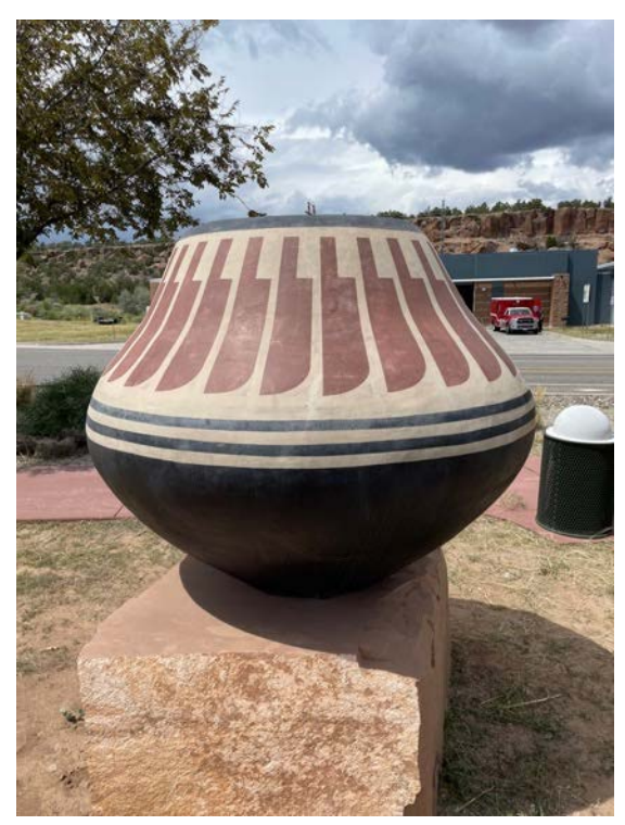
Detail: Backside of White Rock Pottery Project Pot #6 After Treatment

In order to create more time for conservation treatments, a few sculptures in the collection that were deemed stable and in excellent/good condition were slated to be skipped this year as long as they were indeed in good condition once assessed onsite. This allowed for more time and funding to be allocated across the collection for critical maintenance and conservation. There are six artworks that did not receive any form of conservation or maintenance this year, but were assessed during the maintenance cycle. These are: