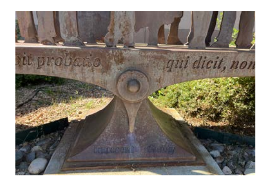
Detail: Front face of Base of The Scale of Justice Before Treatment

9. The Scale of Justice (01) Testing that was conducted last year to determine the appropriate clear coat, this year the test areas were examined. All of the coatings tested were successful in minimizing rust. An acrylic varnish was chosen as the most appropriate because it is the most retreat-able of the options. The sculpture was cleaned. Some of the figures were coated with the acrylic varnish to see how they weather over the next year. A full coating will be applied in 2025.