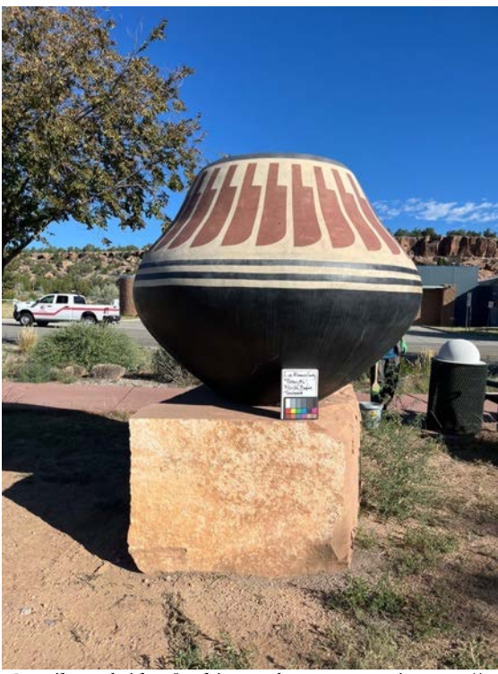
Detail: Backside of White Rock Pottery Project Pot #6 Before Treatment