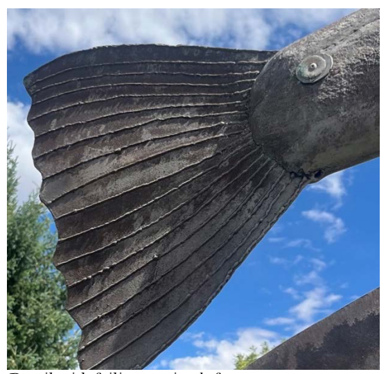
Detail with failing coating before treatment.

6. Brown Trout (02) has a blanched coating that if removed and replaced will look significantly better. Testing was done with lacquer and varnish over the failing clear coat to determine if the sculpture may be coated without removing the flaking clear coat. The testing is being allowed to sit for a year to see if any issues (lifting, flaking, discoloration) may occur over time. If successful, the sculpture will be coated in 2025 with the appropriate coating. If unsuccessful, the old coating will need to be removed prior to applying a new coating, this may be done in 2025 if time allows.