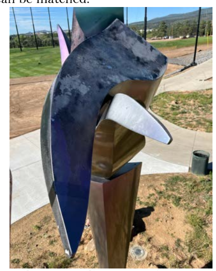
Detail: Top Curvilinear Face of Nexus Before Treatment