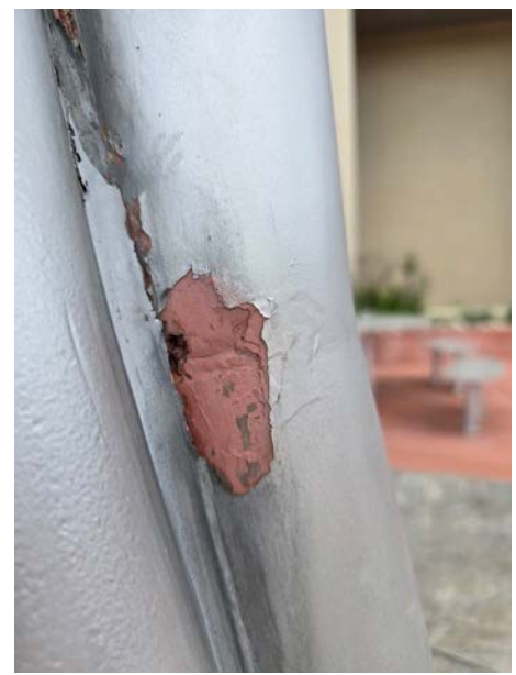
Detail: Area of failed paint pulled back to a stable point prio to painting