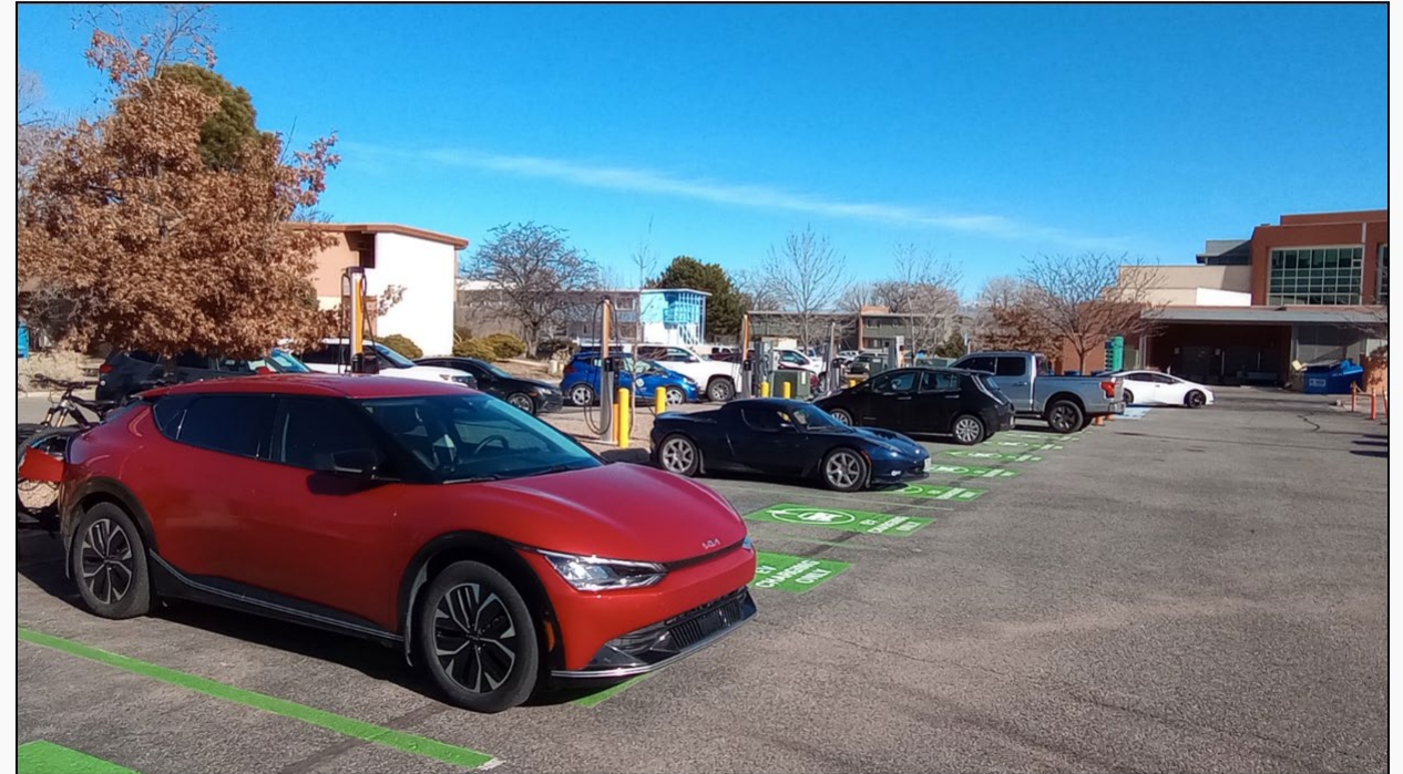
EV charging stations at the Los Alamos County Municipal Building.