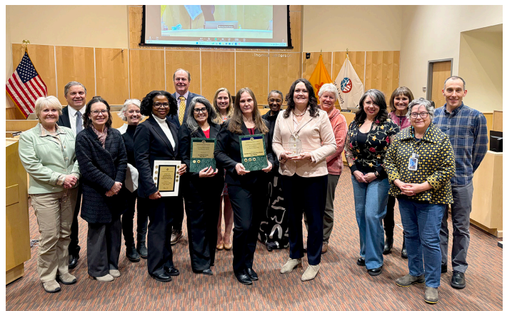
The Kinnikinnik Park ADA Trail Ribbon Cutting was celebrated March 25, 2025. | Rio Arriba County Nursing Home is in the process of being constructed. | The County Council recognizes members of the Administrative Services Finance Division on February 17, 2026 for their Triple Crown Honor issued by the Government Finance Officers Association (GFOA).