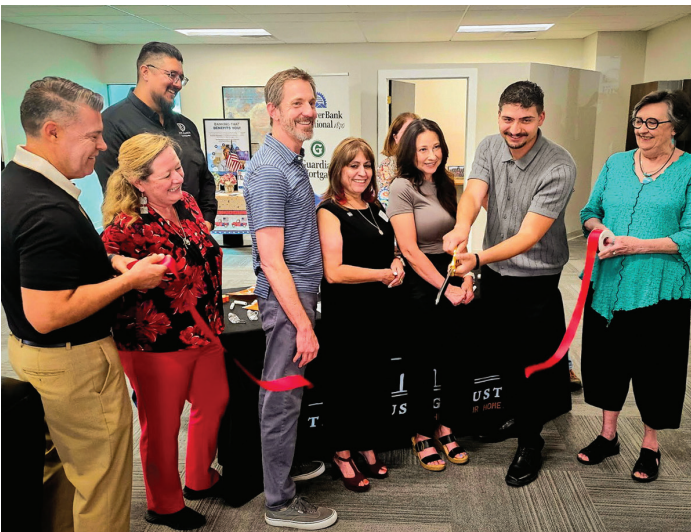
Bee City USA celebrates Earth Day at the Los Alamos Nature Center. | The Urban Trail Ribbon Cutting Ceremony was celebrated February 26, 2025. | County welcomes The Housing Trust to their new office space inside First National 1870.