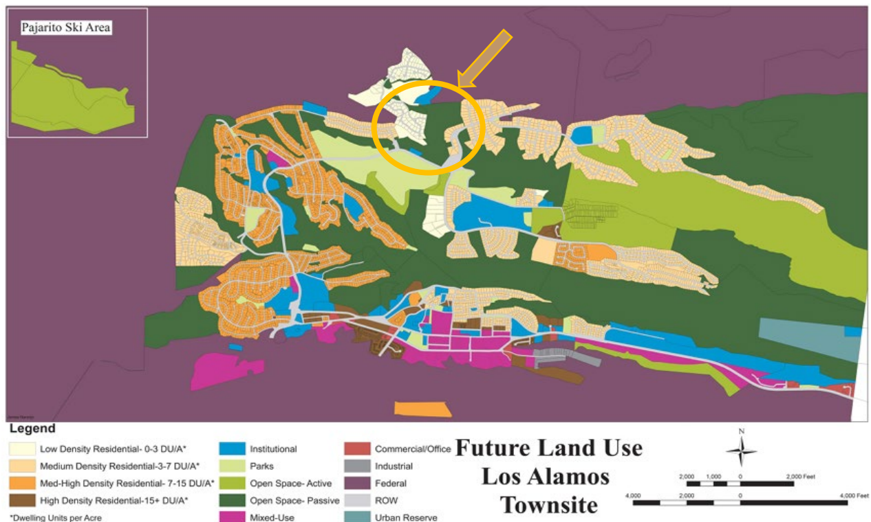
Figure 1: Townsite Future Land Use Map (FLUM), page 111, Comprehensive Plan Los Alamos County 2016. Parcels involved in the application are circled.