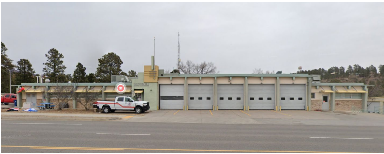
Image 1: Google Earth Street Image, May 2025 – Fire Station 4 from Diamond Drive.

See Attachment A: Application Submittal.