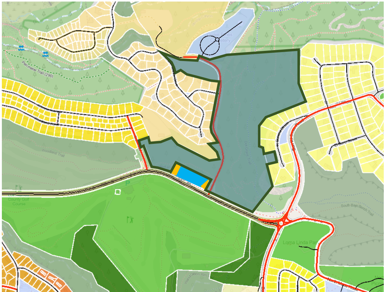
Figure 2: Location Area Map, Collector Streets shown in red. Fire Station 4 is shown in blue, the FLUM Open Space is shown in green. The difference is the FLUM change, shown in orange.