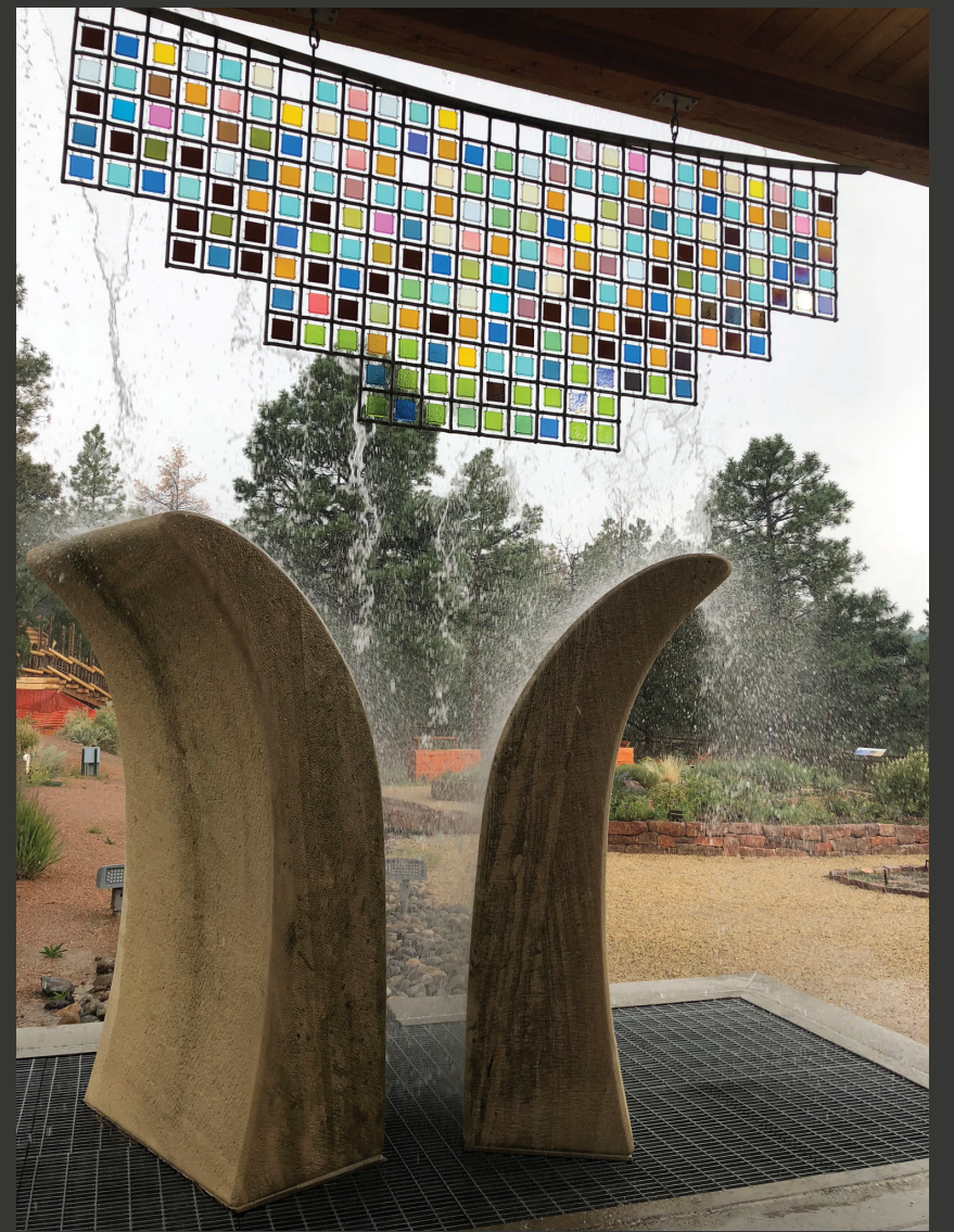
Above: Flower of Flight when installed in 2015; Right: Flower of Flight in the rain after the first few years of growth in 2018.