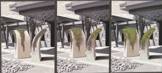
Conceptual illustrations of Flower of Flight with growth over time: 15 years (Sculpture by Greg Reiche)